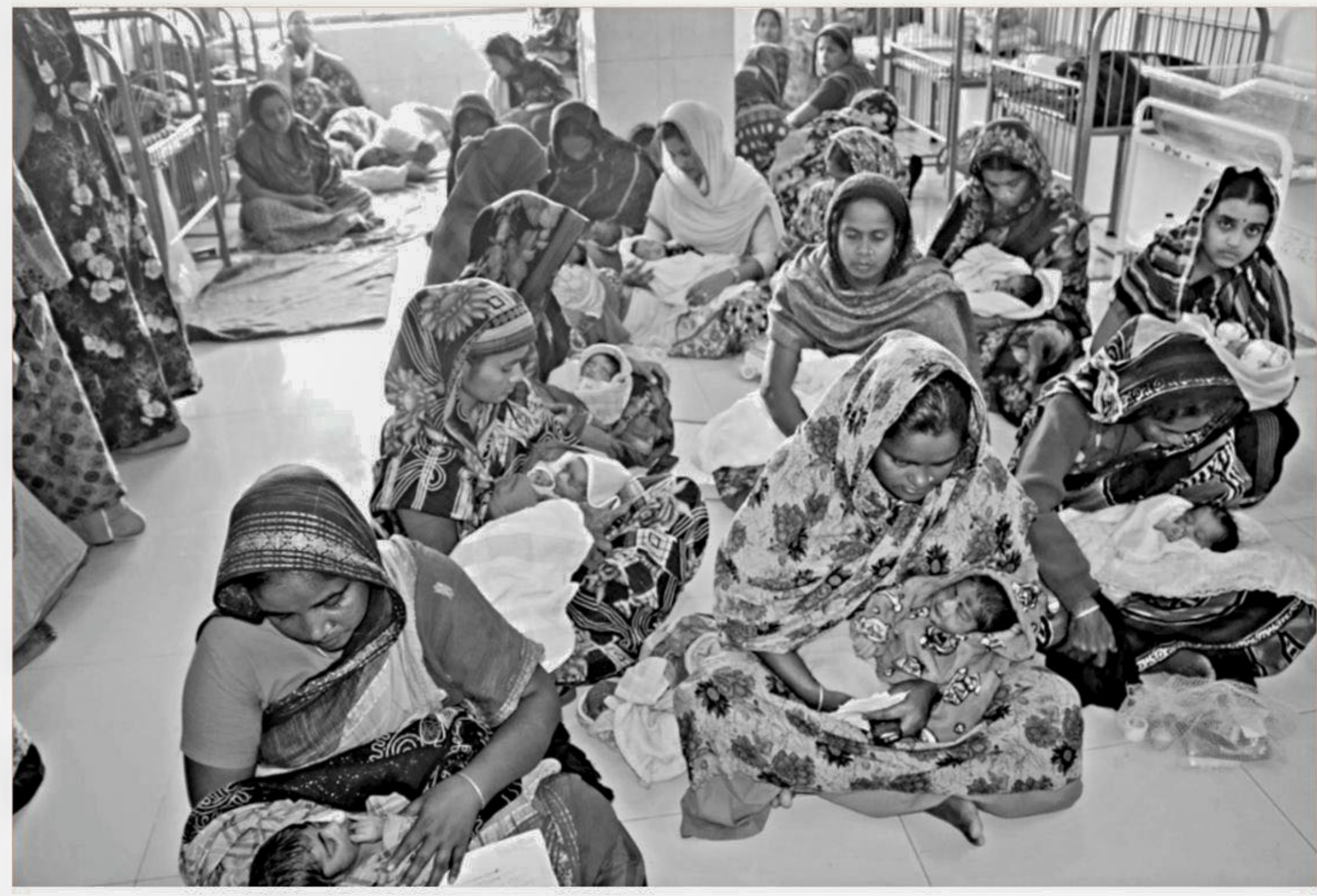
Mothers with their newborns sit on the floor in front of Special Care Newborn Unit (SCNU) at Patuakhali General Hospital for shortage of beds.