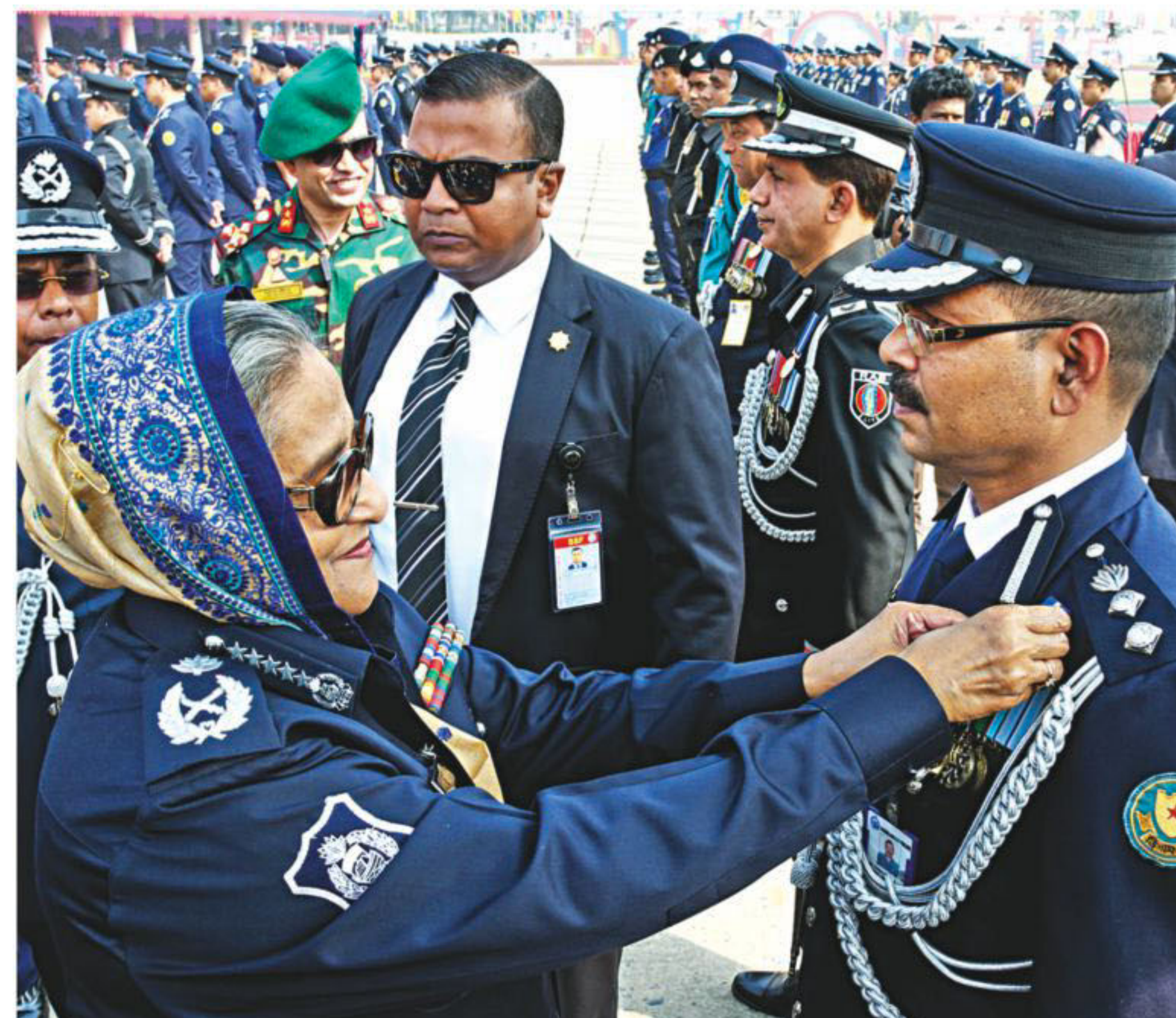
Prime Minister Sheikh Hasina adorns a police official with a badge for bravery and excellence in service at the inaugural ceremony of the Police Week-2017 at Rajarbagh Police Lines in the capital yesterday. She also inquires about the health of the police personnel who got injured while discharging their duties.

Eight cases have been filed so far in connection with the attack, and law enforcers have arrested 109 people, including AL and BNP leaders.