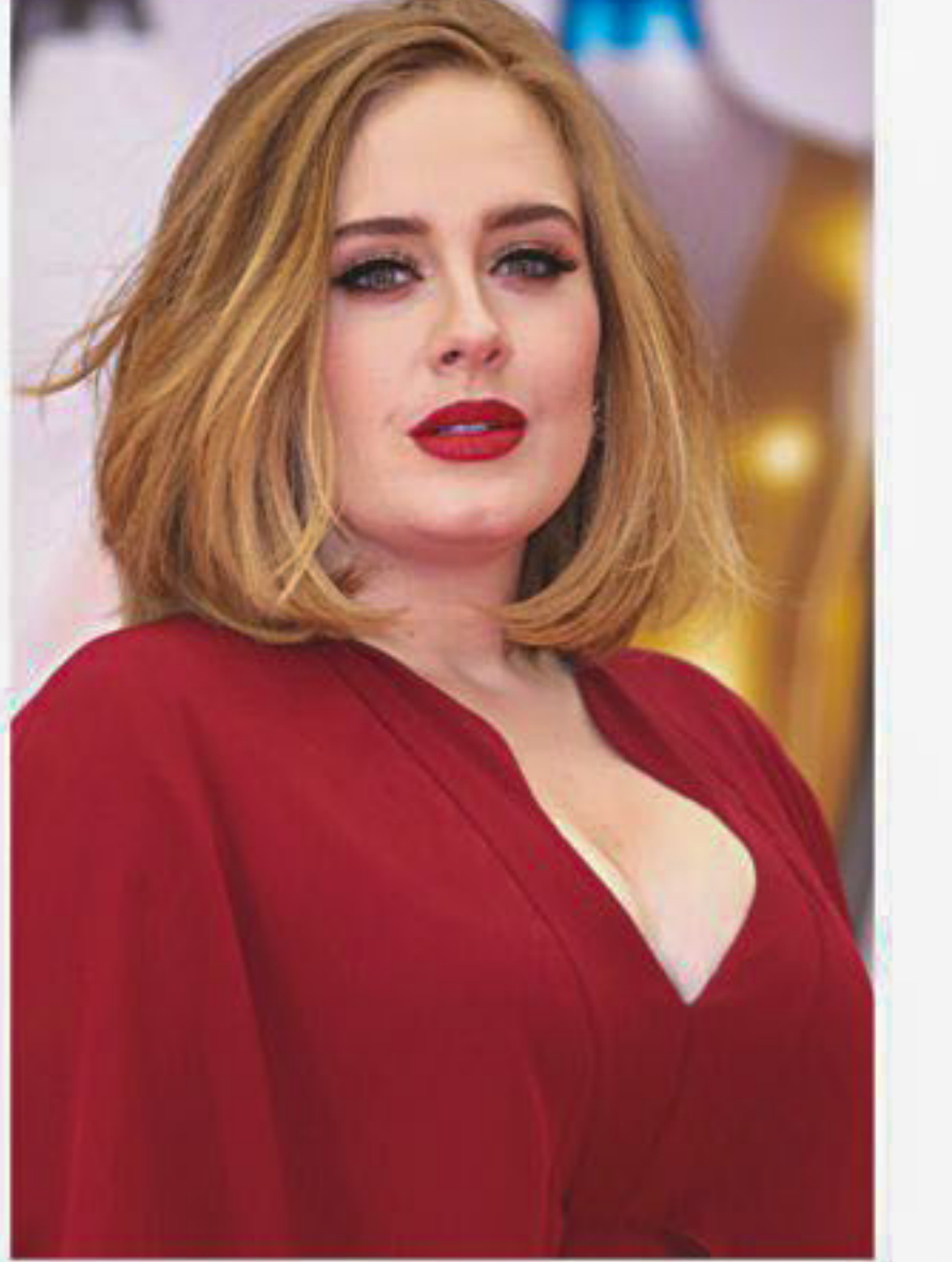
Rihanna and Kanye West are close behind with eight nods each.

British superstar singer Adele is joining the lineup of performers for the 59th annual Grammy Awards, which takes place February 12 from the Staples Center in Los Angeles.