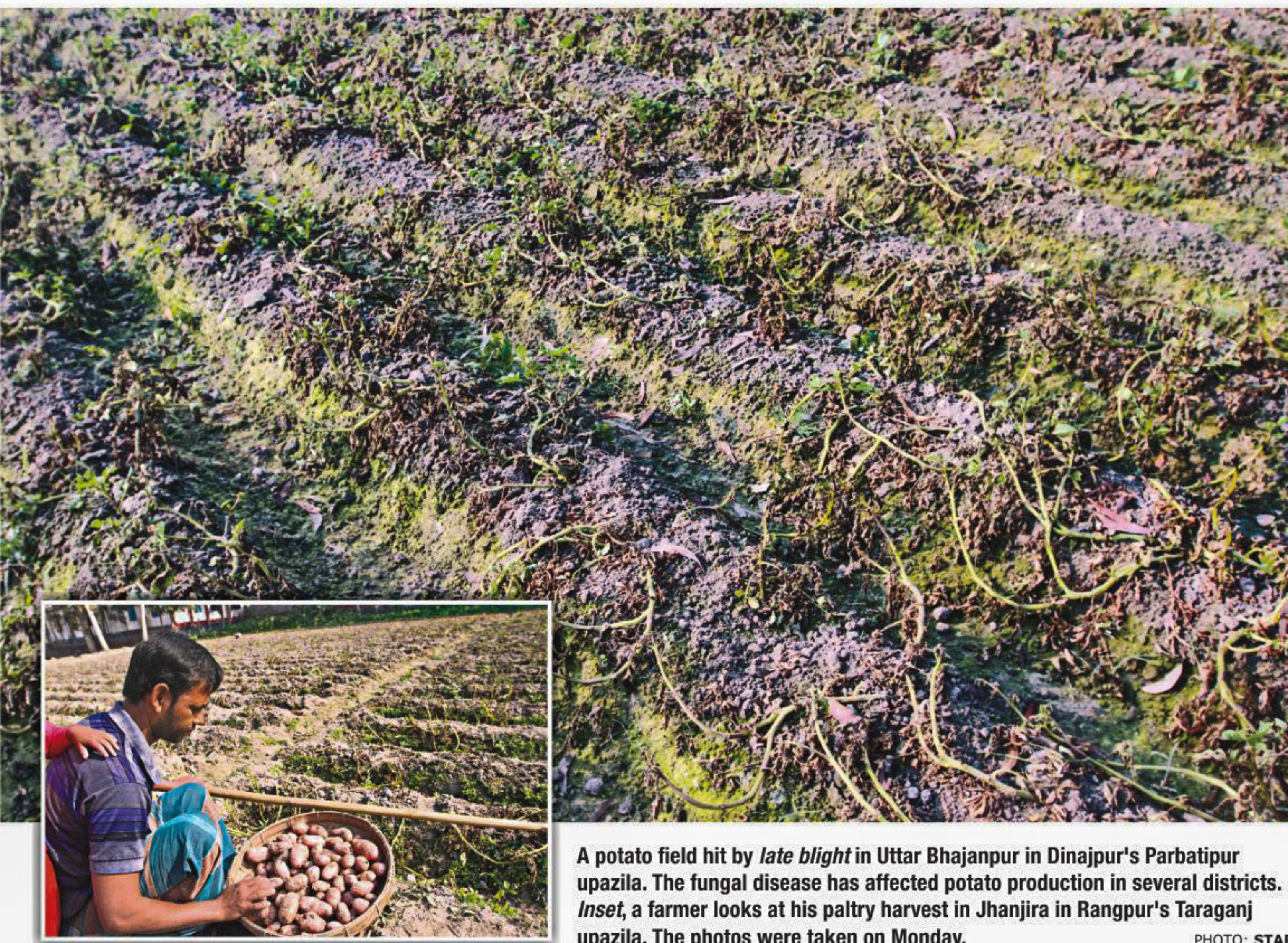
A potato field hit by late blight in Uttar Bhajanpur in Dinajpur's Parbatipur upazila. The fungal disease has affected potato production in several districts. Inset, a farmer looks at his paltry harvest in Jhanjira in Rangpur's Taraganj upazila. The photos were taken on Monday.