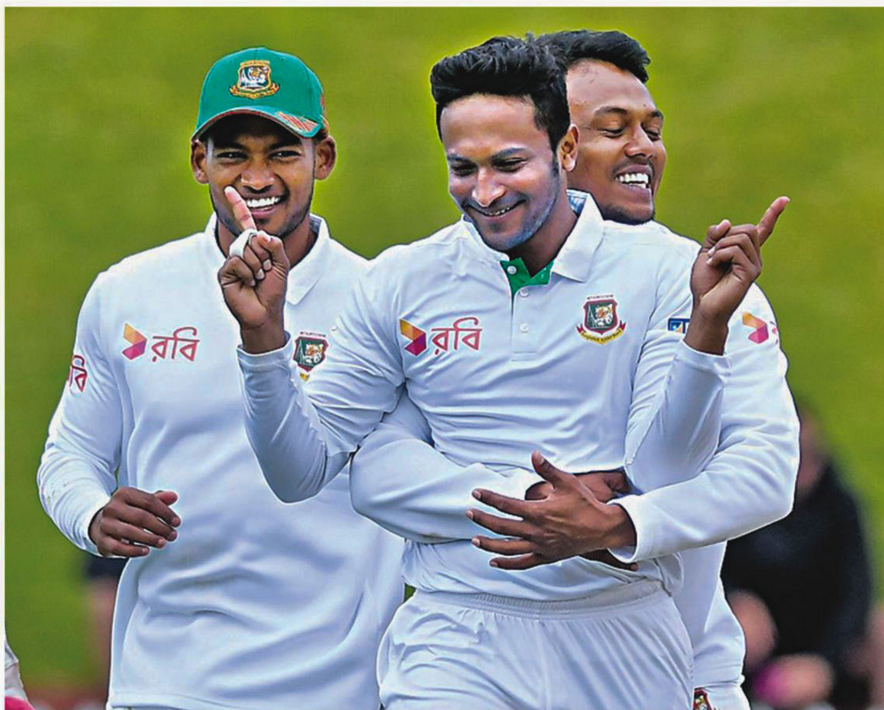
Bangladesh's ace all-rounder Shakib Al Hasan came up trumps in the dying stages of the second day of the second Test against New Zealand, taking three wickets to peg the visitors back and put the Tigers on the ascendancy at the Hagley Oval in Christchurch yesterday.