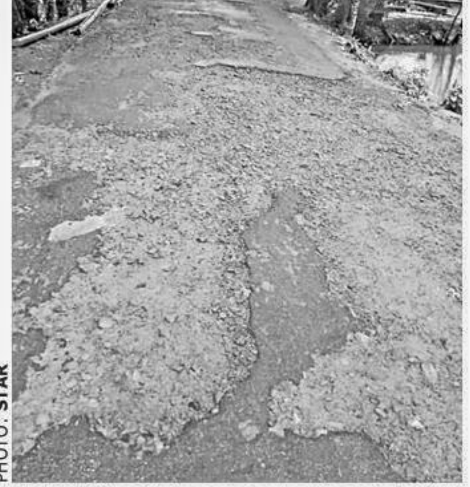
A portion of 30km dilapidated road from Taltoli in Barisal city to Fakirbari in Muladi upazila. The photo was taken recently.

Nazrul Islam, a vegetable trader living in Sayestabad, said the rickshaw-van pullers now charge Tk 180 to Tk 200 where it was