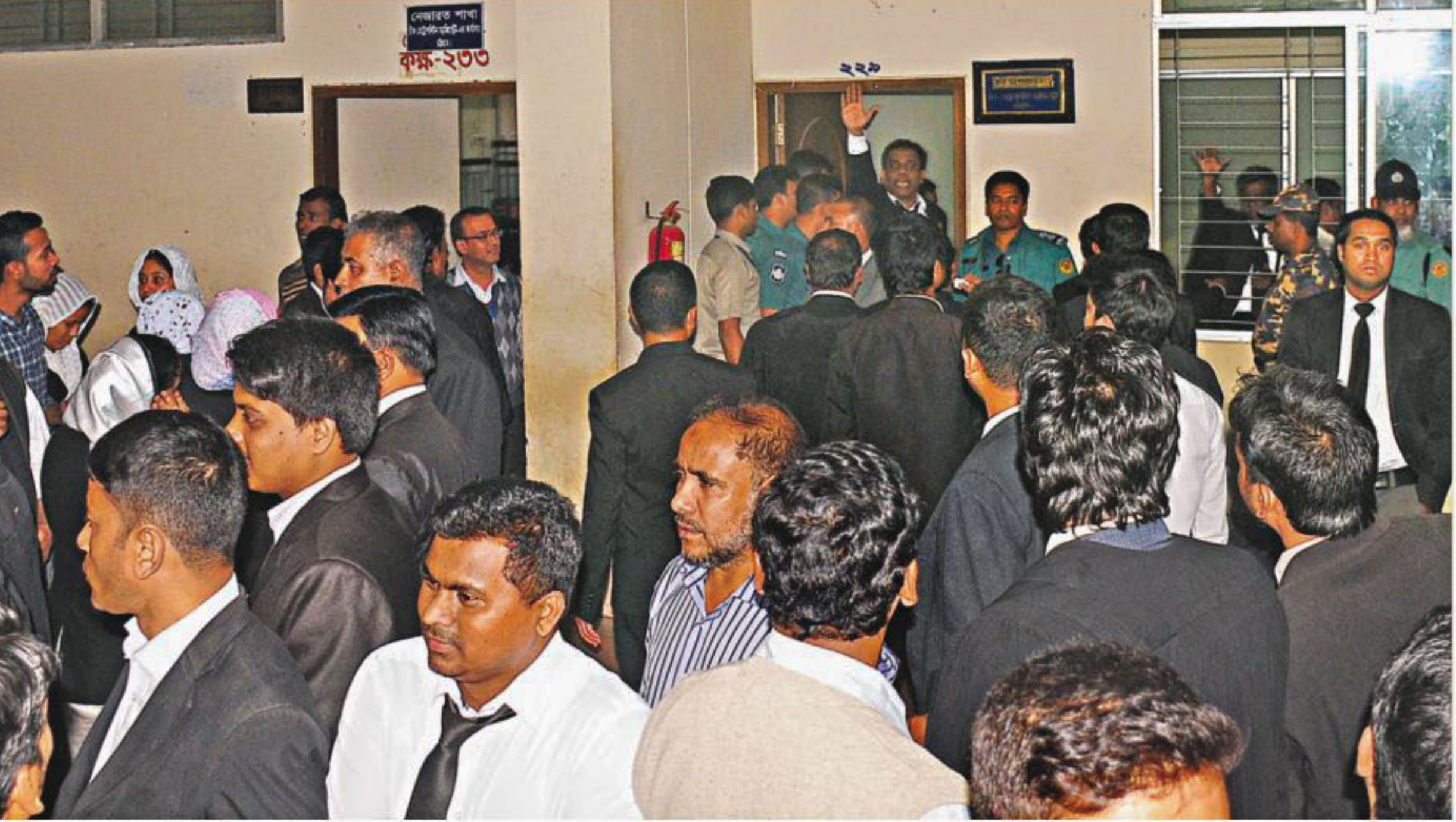
Lawyers demonstrate inside Chittagong Court Building yesterday afternoon after the court rejected the bail petition of an accused lawyer and his wife in a human trafficking case. They also got into a scuffle with police, broke windows of the judge's chamber room, and stopped journalists from taking pictures and snatched some of their cameras, according to police and eye witnesses. The two accused were arrested from Chittagong airport on charge of helping two persons including a Rohingya woman to go to Saudi Arabia with fake Umrah visa documents. They however secured bail after their hearing was held in another court.