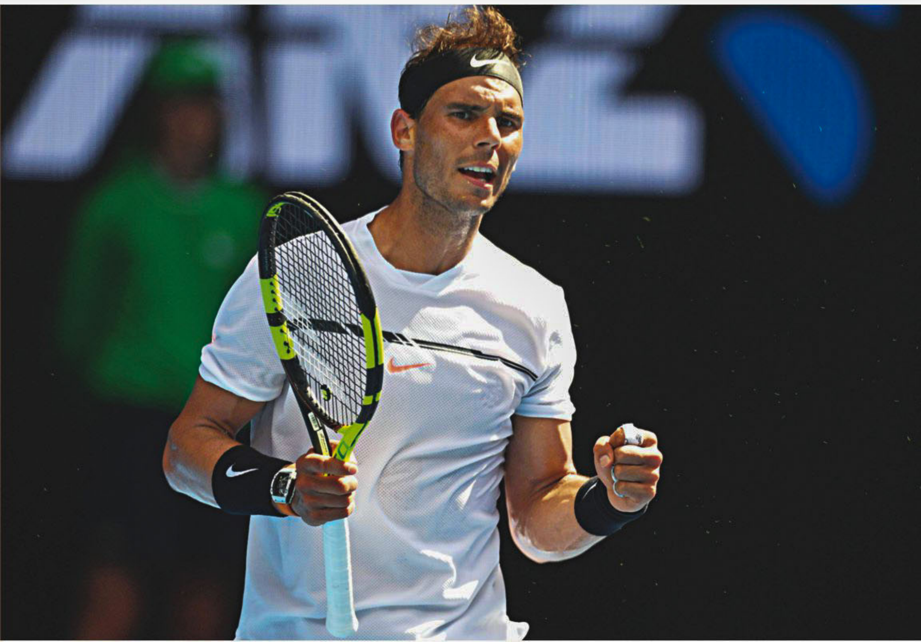
Rafael Nadal of Spain celebrates winning a point against Germany's Florian Mayer during their men's singles first round match of the Australian Open in Melbourne yesterday.