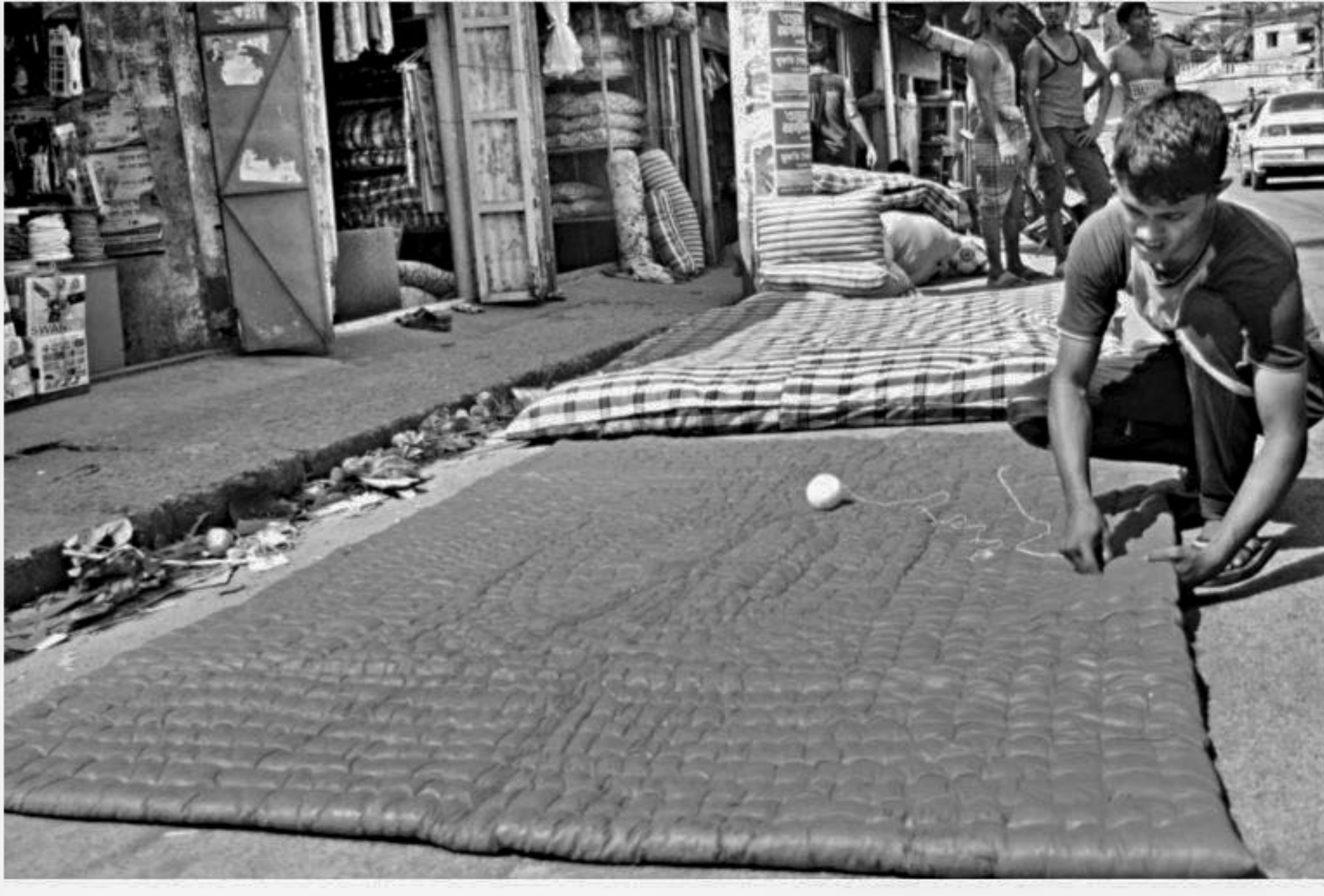
A comber busy making quilt in front of a roadside shop in Sylhet city as the demand for the item sees rise amid fall in temperature.