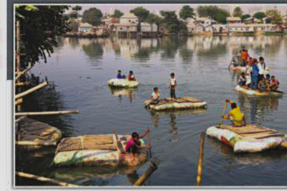
Boats lie idle on the capital's Banani lake following a decision taken by the authorities concerned to stop the water transportation service since according to them the boatmen did not have permission to navigate on the water body and to ensure security in the area, putting many of them in dire straits, who, out of desperation still try to earn a living by helping people cross the lake on makeshift rafts made with large sand bags, inset. The photos were taken recently.