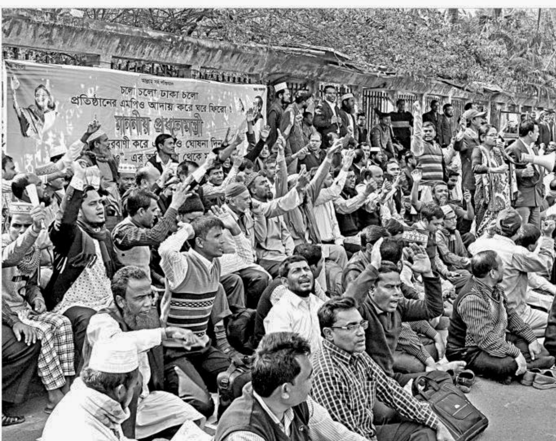
Teachers and employees of non-MPO educational institutions stage a demonstration in front of the capital's Jatiya Press Club yesterday demanding inclusion of their institutions in the government's Monthly Pay Order (MPO) facility.