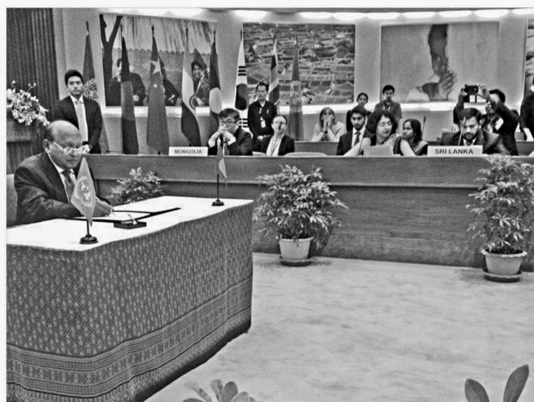
Commerce Minister Tofail Ahmed presides over the fourth ministerial council of Asia-Pacific Trade Agreement in Bangkok of Thailand yesterday.