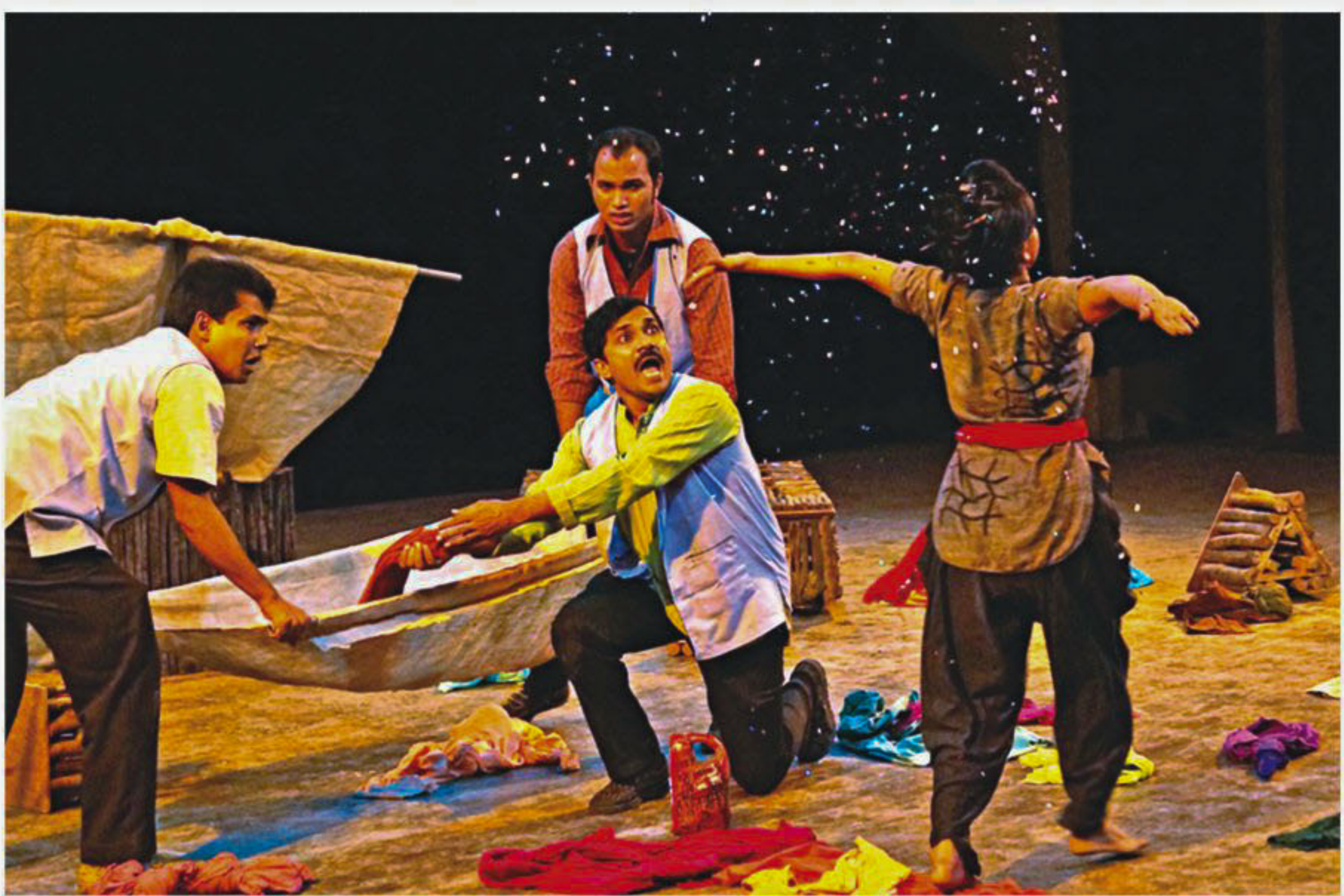
A scene from "Hargaz".