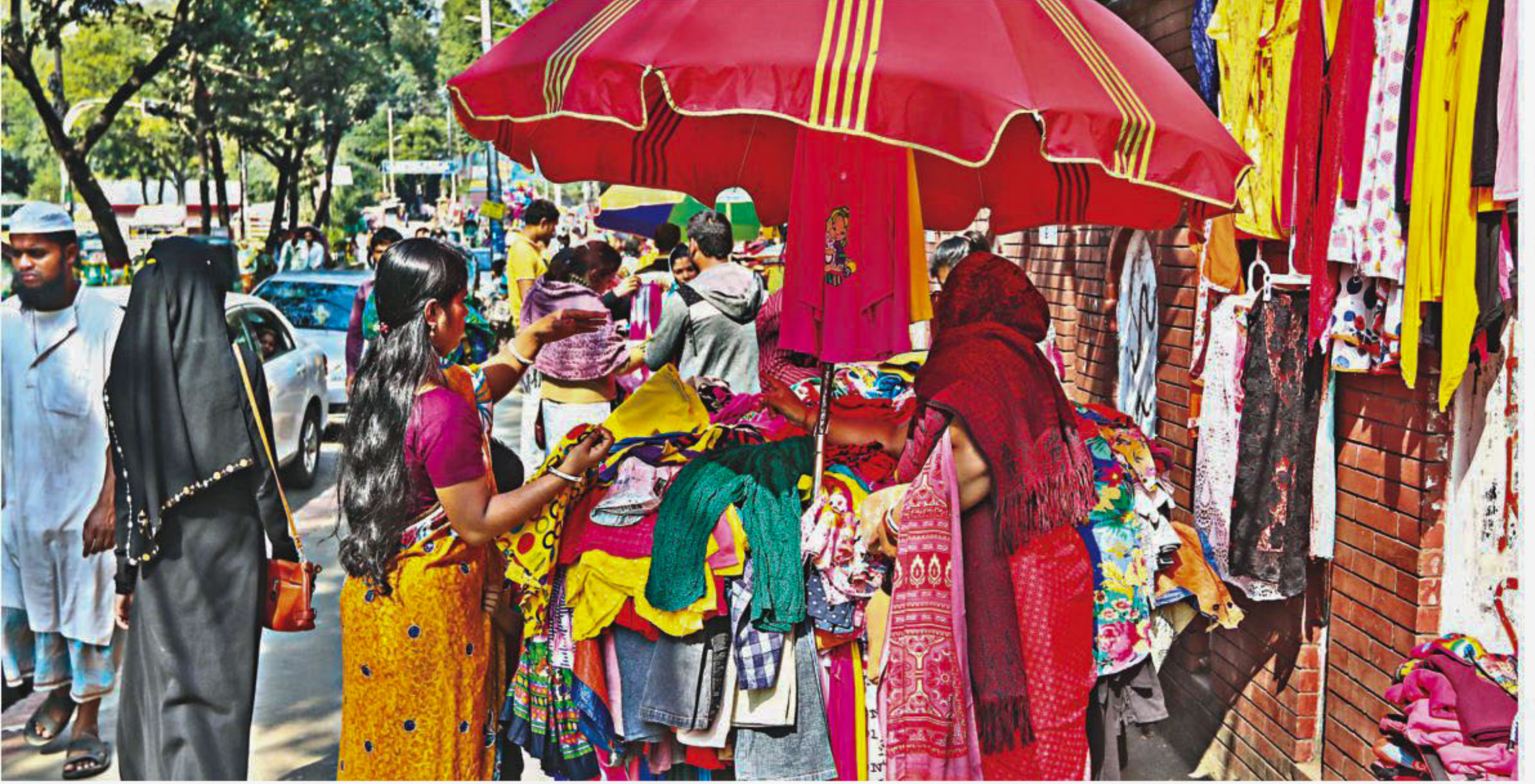
Makeshift shops occupy the entire footpaths, while cars are parked on the street, making people's movement immensely difficult, in Chittagong city's Jamal Khan area where three schools are located. The photo was taken on Wednesday.

The general members will pay Tk 500 each, Tk 800 for a couple, and life members Tk 400 for the get-together.