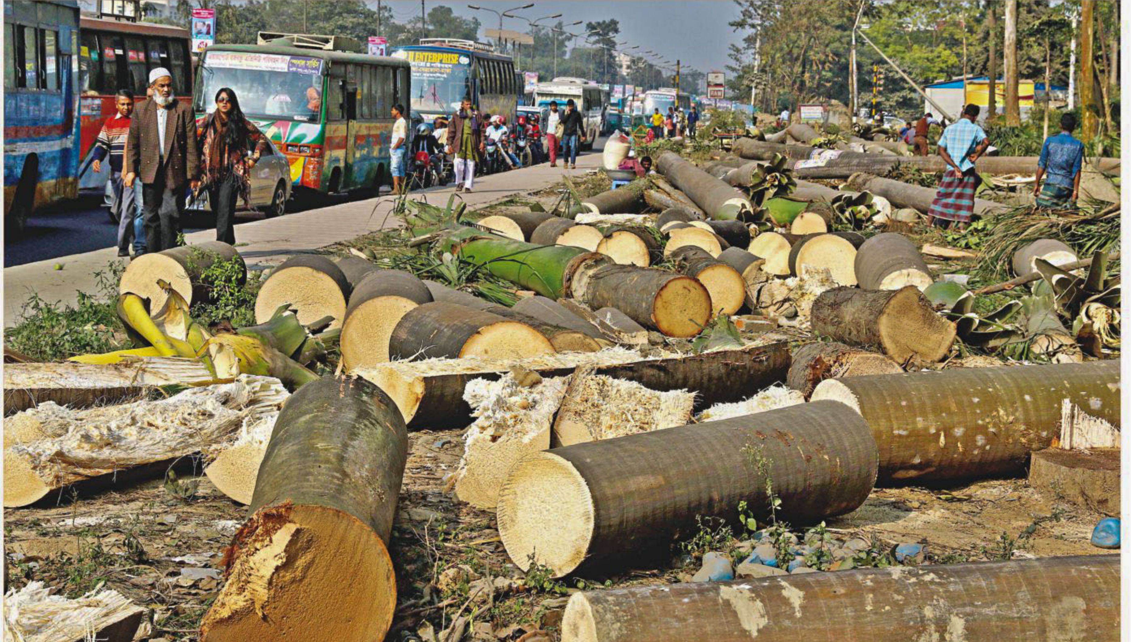
CONCRETE TO REPLACE GREENERY: The Roads and Highways Department has chopped down around 150 roadside trees in the capital's Banani for construction of a flyover. The photo was taken yesterday.

STAFF CORRESPONDENT, Ctg Police claimed to have detained 11 activists of Islami Chhatra Shibir while allegedly holding a "secret meeting" at a hostel of Chittagong Eden School and College in Mohammadpur area of the port city yesterday evening. All of them are leaders of Shibir, claimed Waliuddin Akbar, inspector (investigation) of Panchlailsh Police Station. A good number of books on Jihad were also seized, he said.