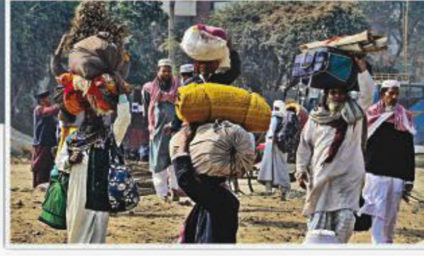
Hundreds of tents pitched on the bank of the Turag to house pilgrims as the first phase of Biswa Ijtema, the second largest congregation of Muslims after Hajj, begins today. Inset, devotees head for the Ijtema ground in Tongi.