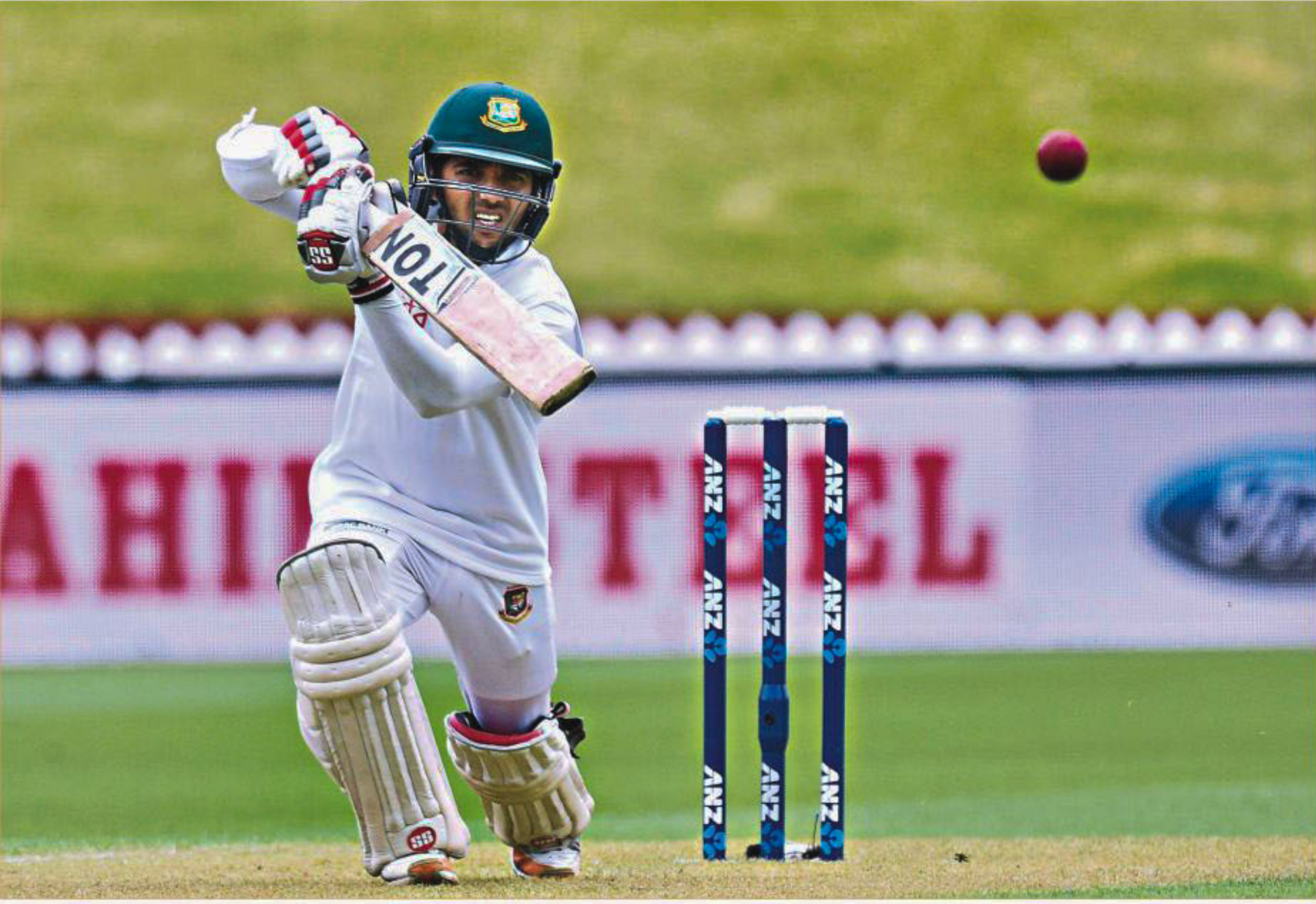
Bangladesh's Test specialist Mominul Haque was a picture of concentration and sound judgement during his unbeaten innings of 64 on the rain-shortened first day of the first Test against New Zealand at the Basin Reserve in Wellington yesterday.