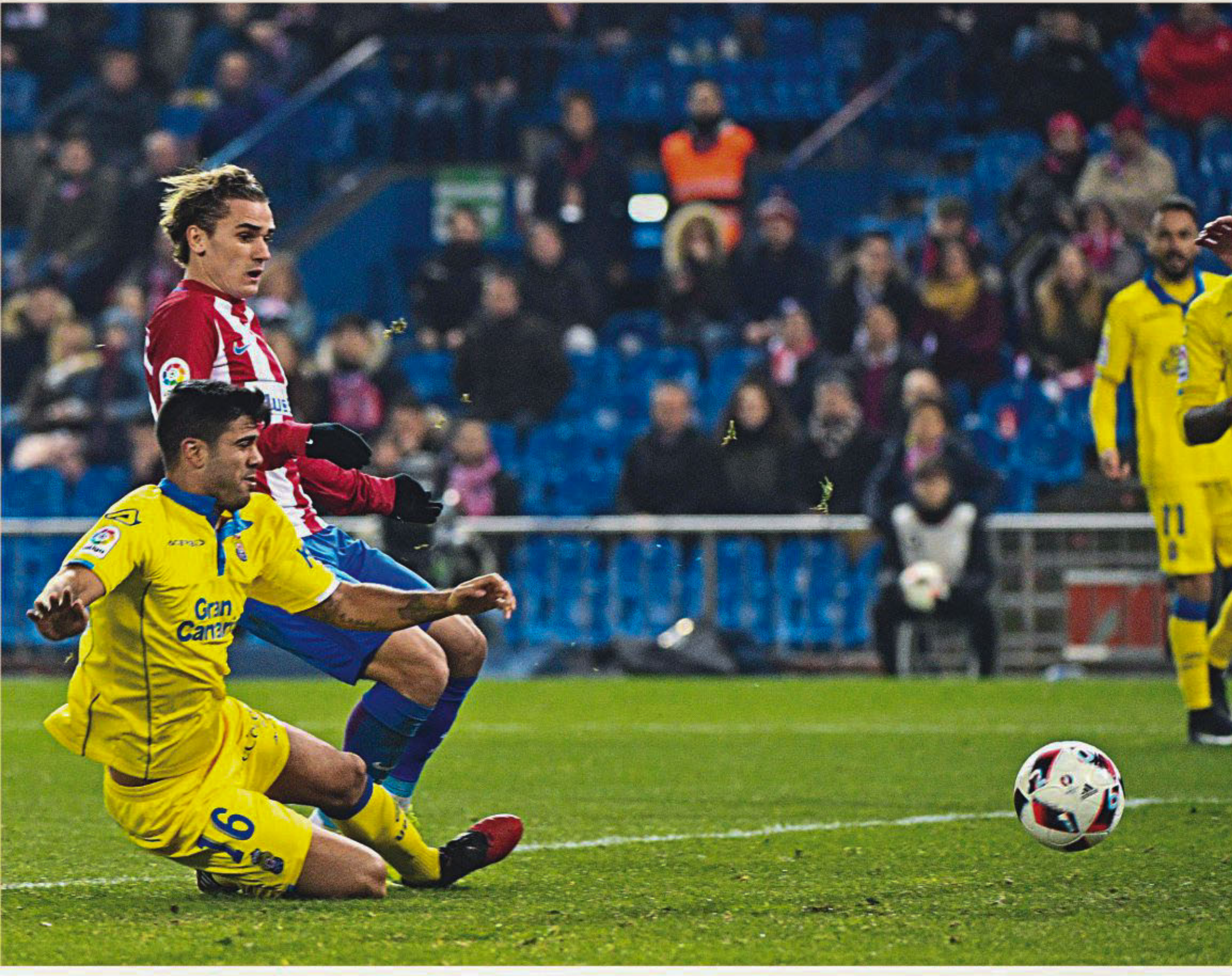
Atletico Madrid striker Antoine Griezmann (C) scores the opening goal against Las Palmas during their Copa del Rey round of 16 second leg tie at the Vicente Calderon Stadium on Tuesday.