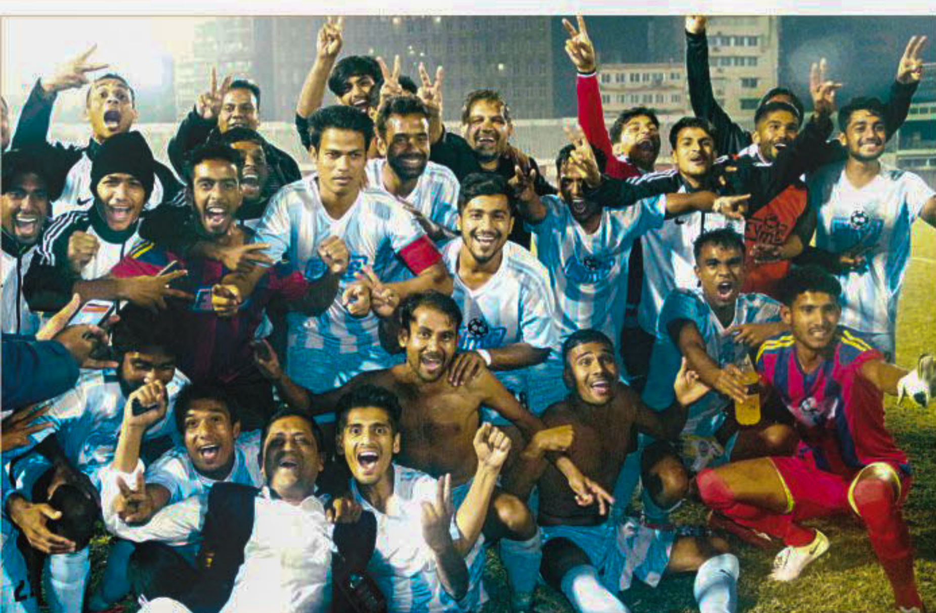
Players and officials of Fakirerpool Youngmen's Club immerse themselves in unbridled celebration after clinching the title of the Bangladesh Championship League at the Bangabandhu National Stadium yesterday.

Meanwhile, Chittagong Mohammedan were relegated to lower division with 10 points.