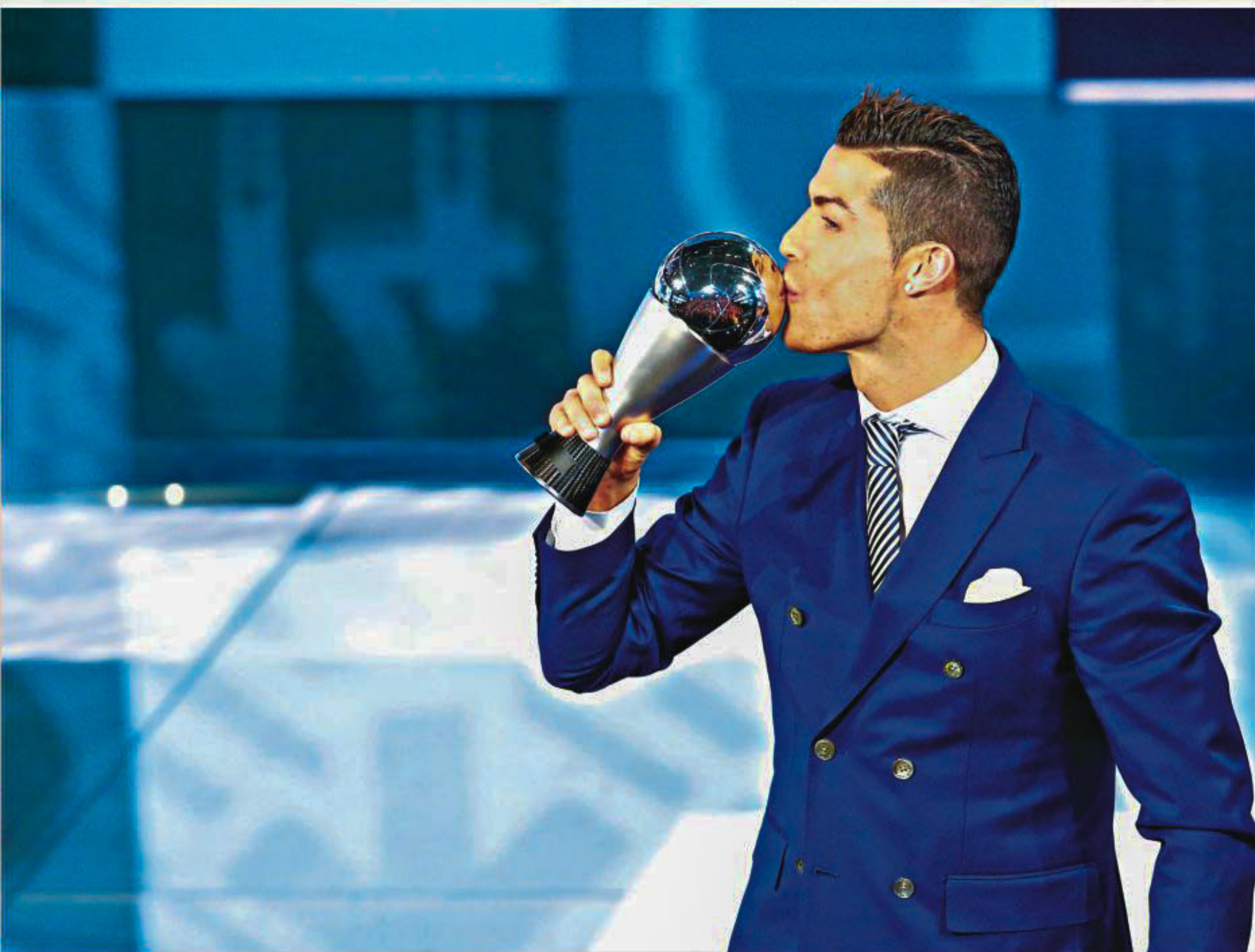
An emotional Cristiano Ronaldo kisses his trophy after being named FIFA's best men's footballer of 2016 on Monday and adding yet another prize to his glittering career.