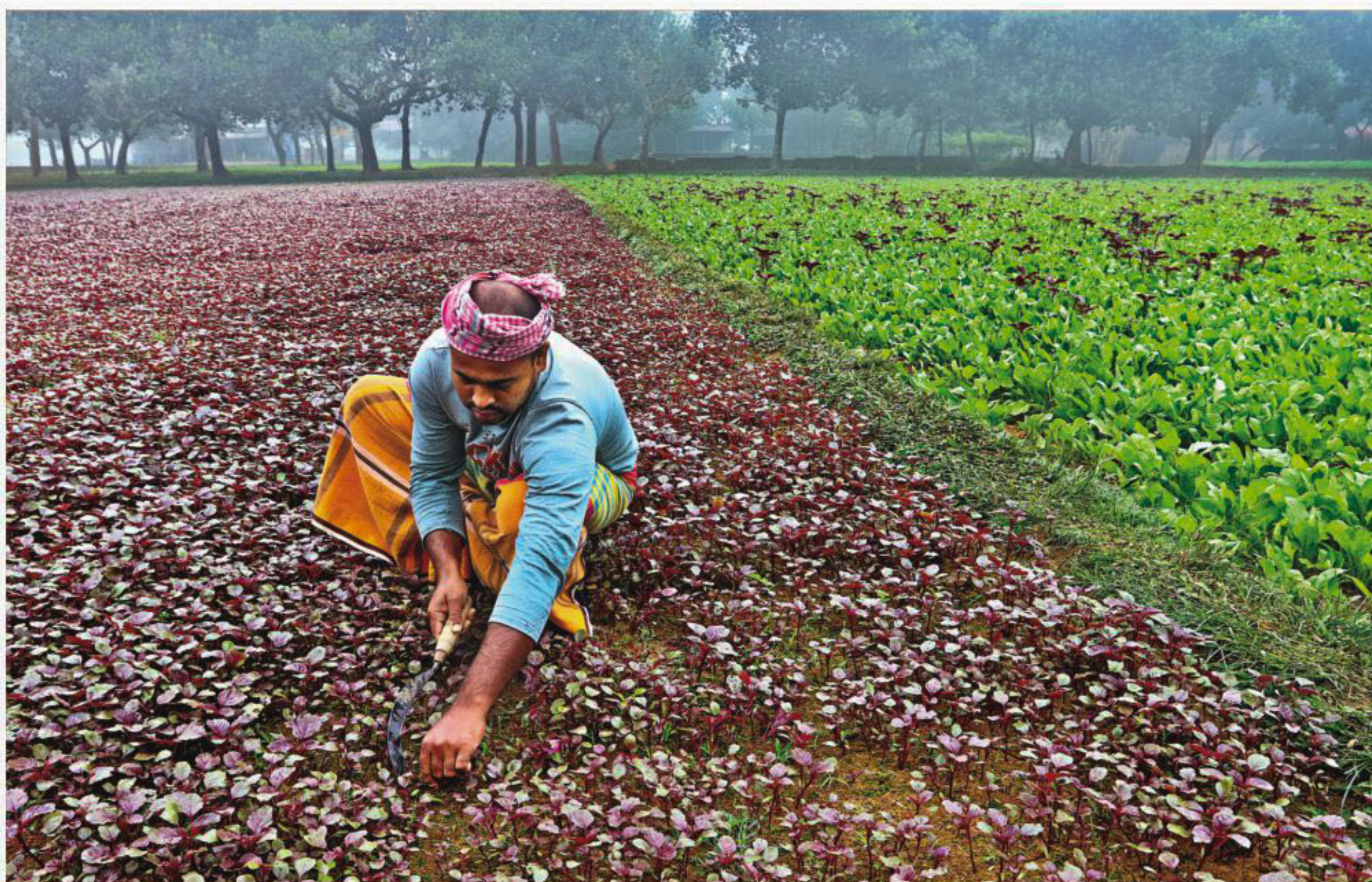
A farmer tends to red amaranth in his field in Savar on the outskirts of the capital. Vegetable production in the country has greatly increased over the last one decade. The photo was taken recently.