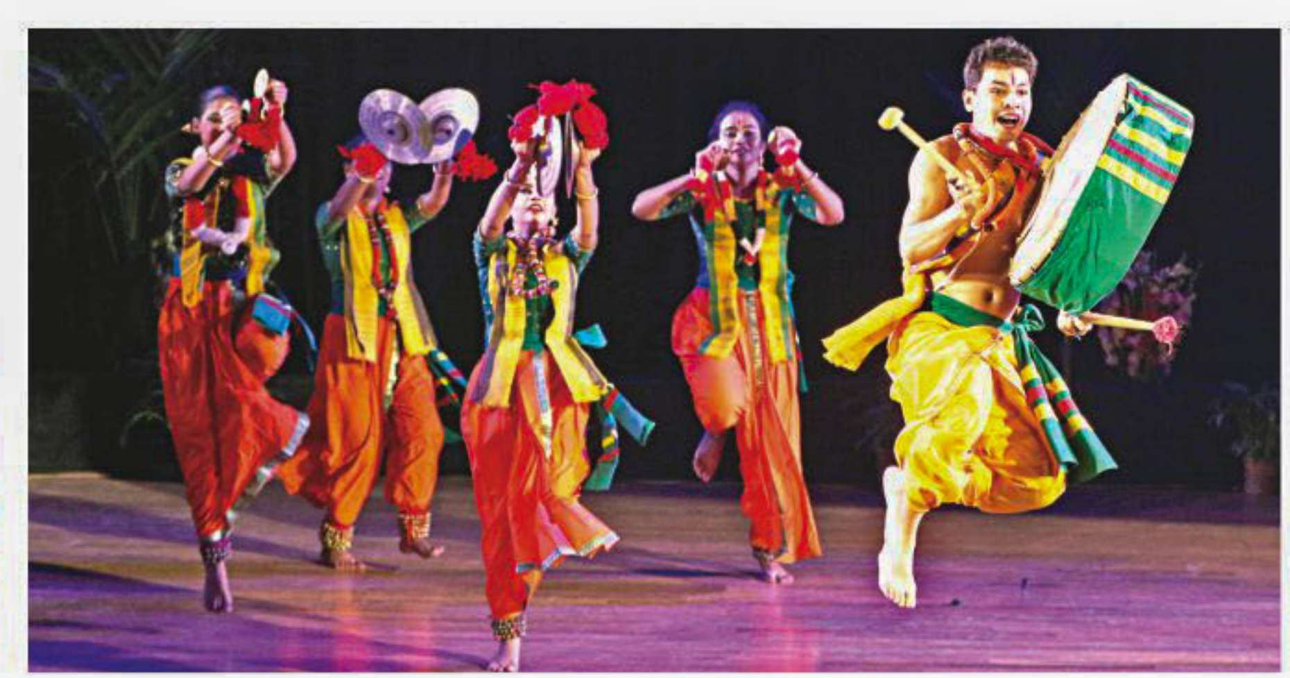
Artistes of Chhayanaut (L) begins the festival; Tamanna's troupe gives a riveting performance.