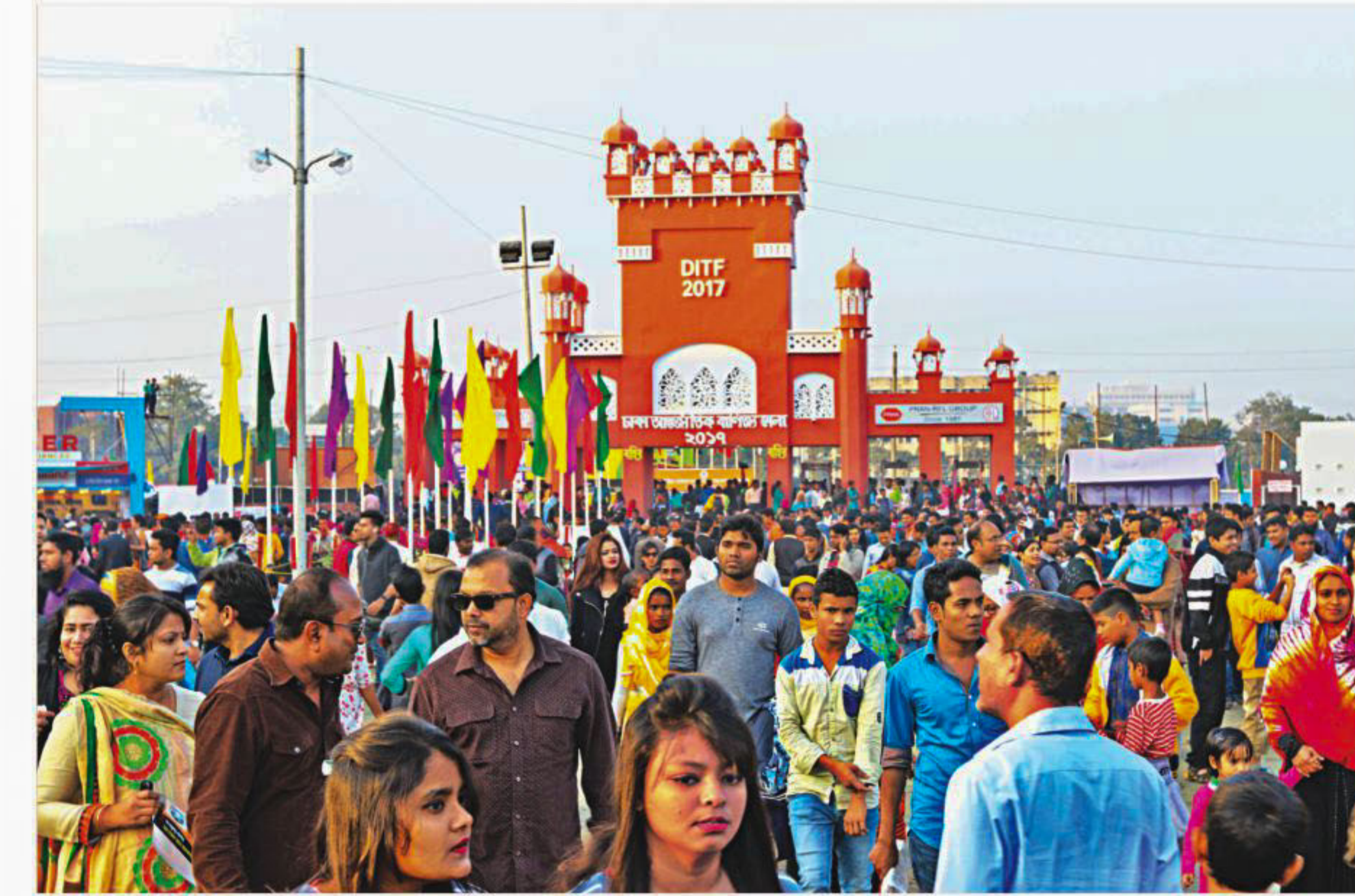
A good number of visitors pour into Dhaka International Trade Fair in the city's Sher-e-Bangla Nagar on the first weekend of the month-long fair yesterday, which started on January 1.