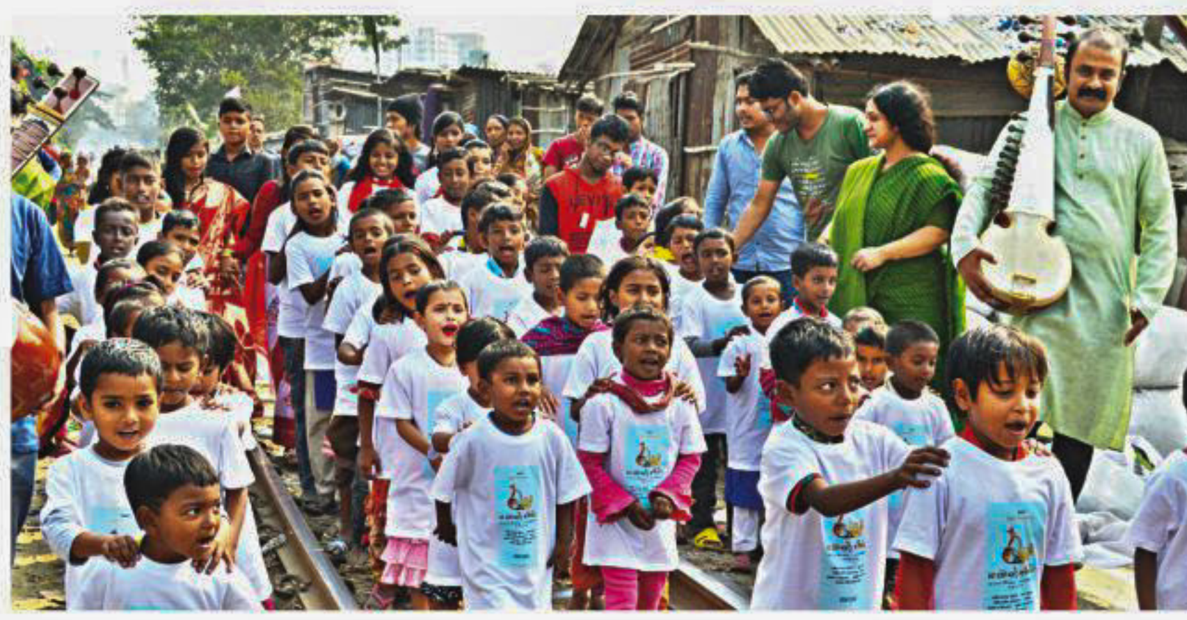
Underprivileged children participate in a music workshop.

STAFF CORRESPONDENT Lakshyapar's 8th Annual Classical Music Conference began on January 3. It was a unique inauguration session set in the shanties of Isdair, Narayanganj. Titled "Briter Baire", the centre of the opening session was Samageet Pathshala, a school of the underprivileged children conducted by Samageet Sangkriti Prangan. The programmes began with the hoisting of the national flag with the rendition of national anthem. Then a rally moved through the