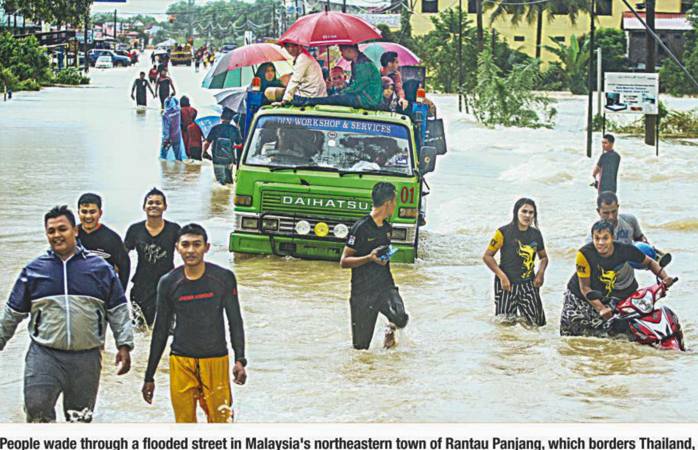
People waded through a flooded street in Malaysia's northeastern town of Rantau Panjang, which borders Thailand, yesterday. Emergency services in Malaysia yesterday deployed boats and trucks, as thousands of villagers were stranded after four days of heavy rain caused flooding in east coast states, officials said.

Although he did not make a specific reference to the incoming Trump administration, he called on Washington to make a "resolute decision to withdraw its anachronistic hostile North Korea policy."