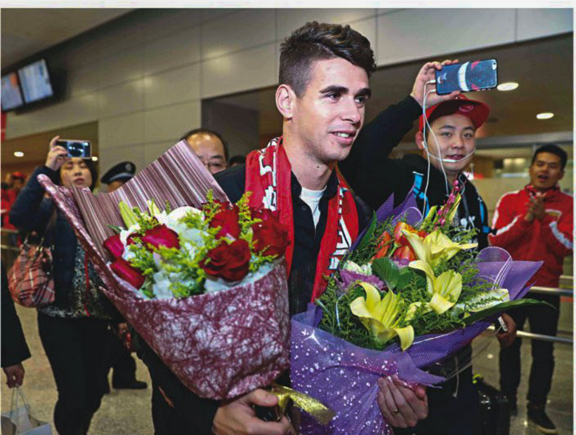
Brazilian midfielder Oscar is cheered upon his arrival at the Shanghai airport yesterday.