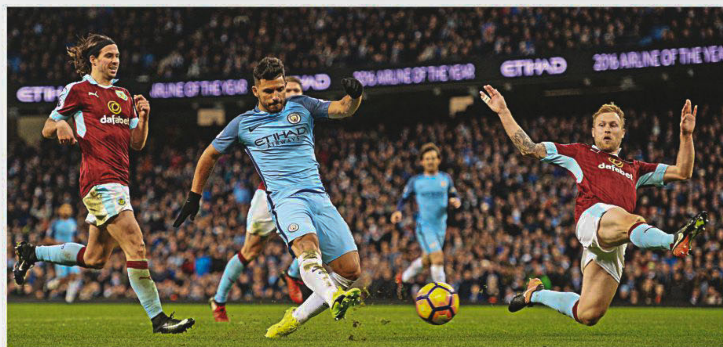
Manchester City striker Sergio Aguero (C) shoots one during his side's 2-1 win over Burnley at the Etihad Stadium yesterday.

Champions Leicester City have now gone 12 league games without an away win following a drab 0-0 draw at Middlesbrough that left them six points above the relegation zone in 14th place.