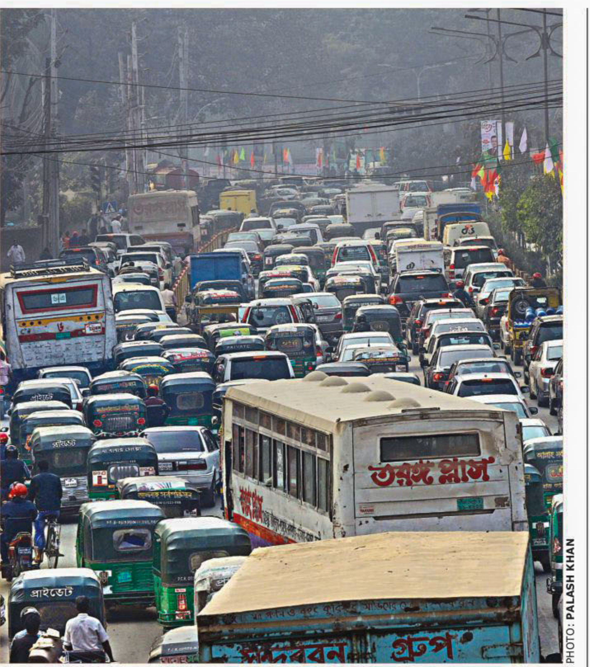
Traffic congestion was suffocating in the capital yesterday, the first day of the new year, apparently triggered by the 31st founding anniversary programme of Jatiya Party organised in Suhrawardy Udyan. The photo was taken at Kakrail.

Border Guard Bangladesh-BGB seized two tokay geckos, smuggled from India, worth around Tk 5 crore during separate drives at Machhimpur and Banstala borders in Sunamganj yesterday. The geckos, which are prohibited to catch and sell in order save the rare species, were handed over to forest division, said BGB officials, adding that the smugglers managed to flee.