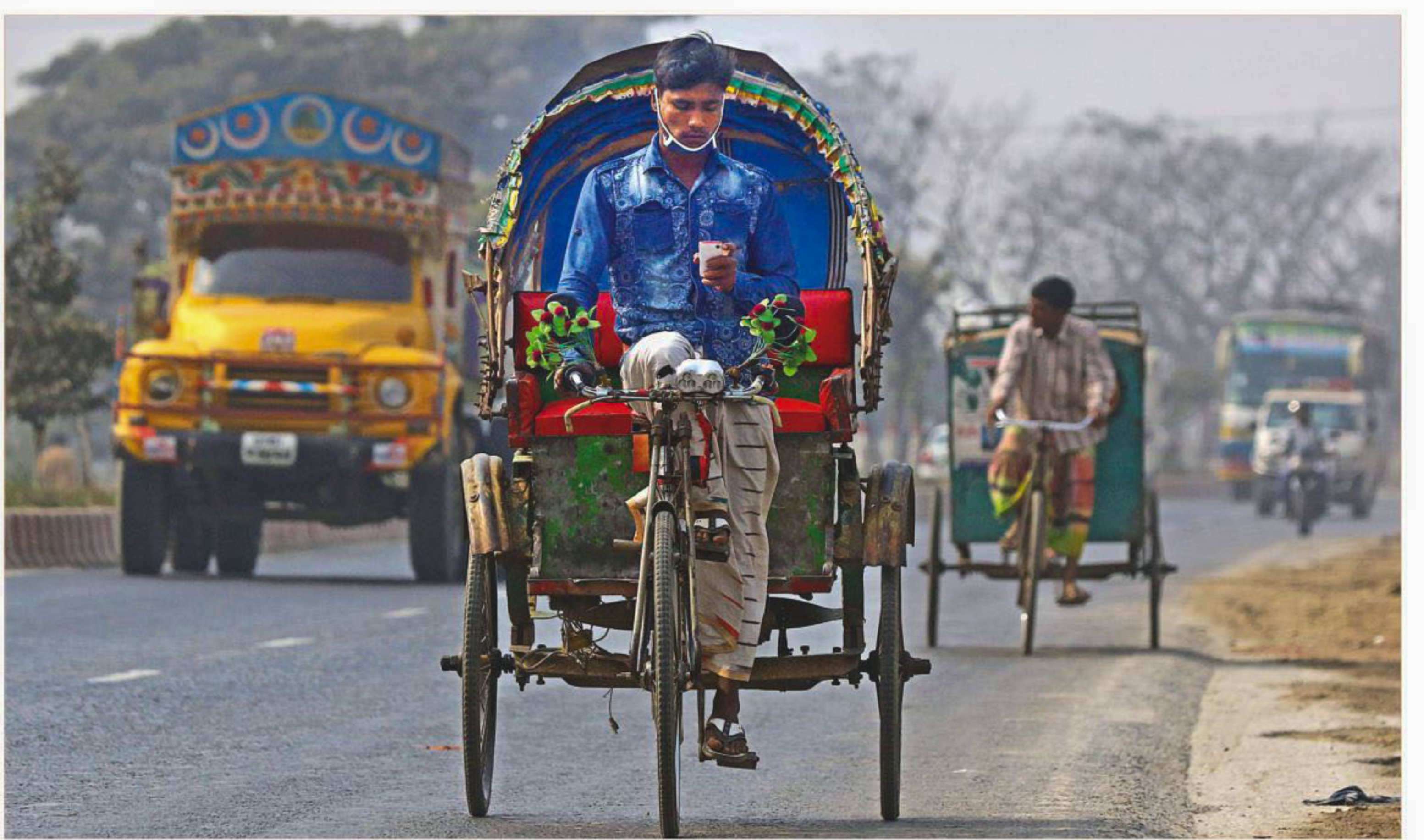
The puller of an illegal battery-run rickshaw engrossed in his cellphone yesterday, that too defying a bar on plying of such vehicles on the busy Dhaka-Aricha highway, oblivious that an unmindful twist of the throttle could put him and others in grave danger. The photo was taken at Amin Bazar in Savar yesterday.