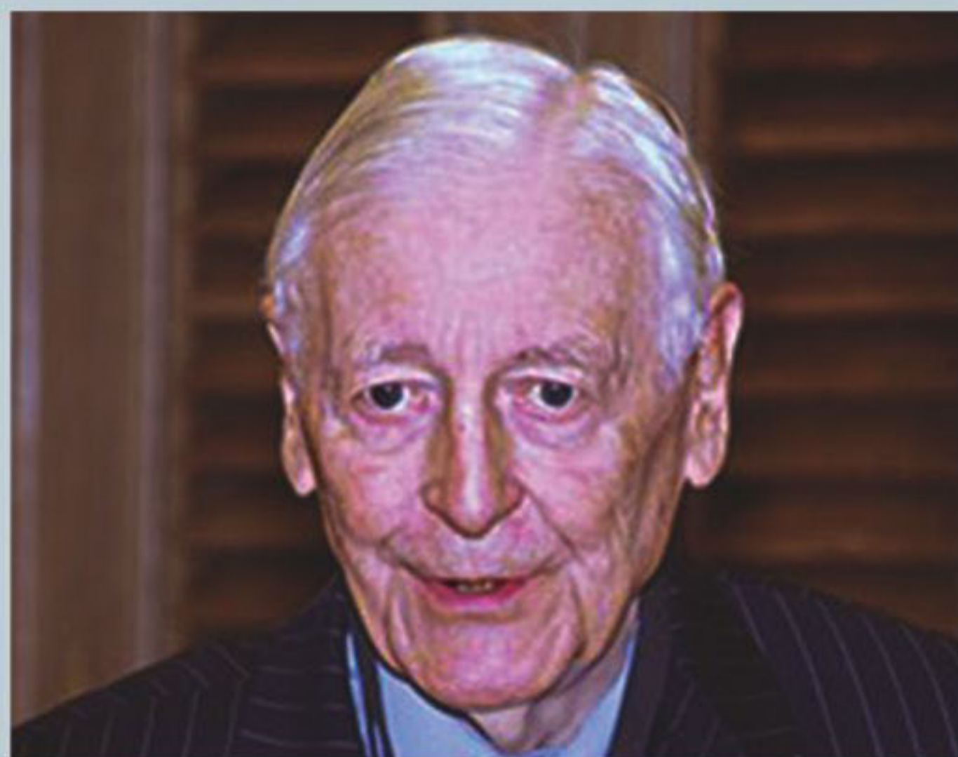
LORD AVEBURY SEPTEMBER 1928 – FEBRUARY 14, 2016

A former Chief of the Indian Army and a former Governor of Jammu & Kashmir, General Rao had commanded a division of the army during the Liberation War and was instrumental in the capture of Sylhet and liberation of northeast Bangladesh.