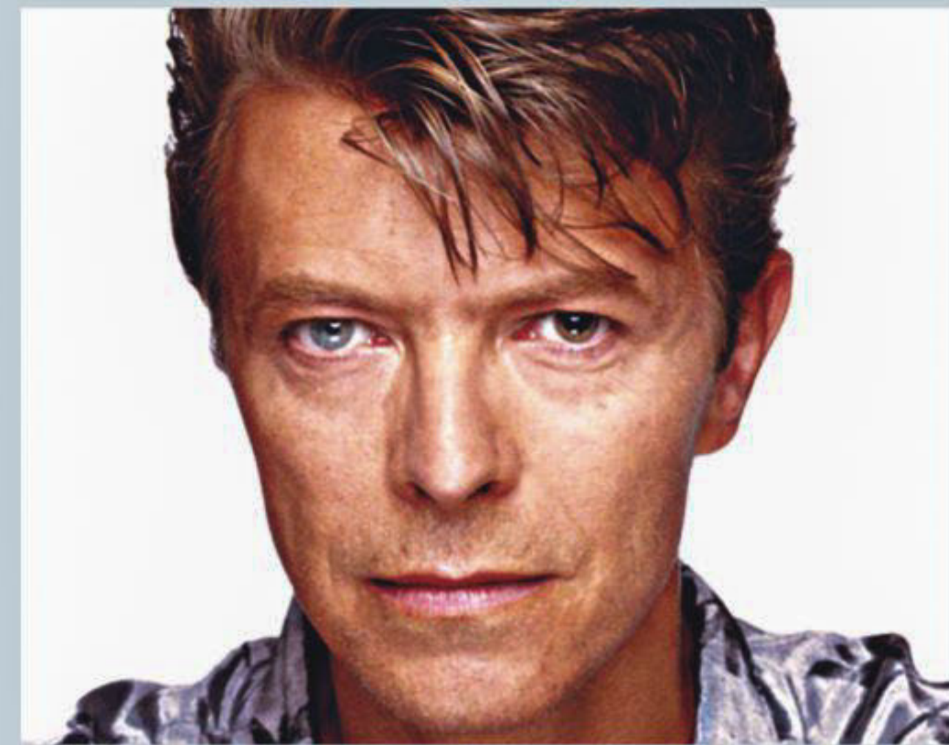
ALAN RICKMAN FEBRUARY 21, 1946 – JANUARY 14, 2016

In over 50 years, the legendary British singer was at the vanguard of contemporary culture as a musician, artist, icon and a constant influence on generations of artists, writers and designers. His record sales, estimated at 140 million worldwide, made him one of the bestselling musicians of the world.