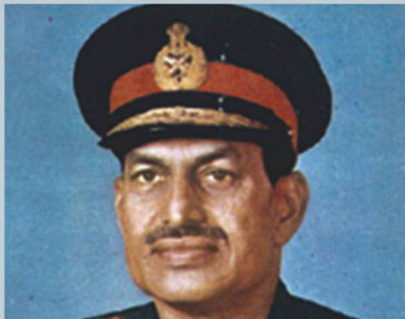
GENERAL KV KRISHNA RAO 1923 – JANUARY 31, 2016

Chief of staff of the Indian army's eastern command during the 1971 Liberation War of Bangladesh, JFR Jacob was awarded the Friends of Liberation War honour in 2012 for his immense contribution to the creation of Bangladesh.