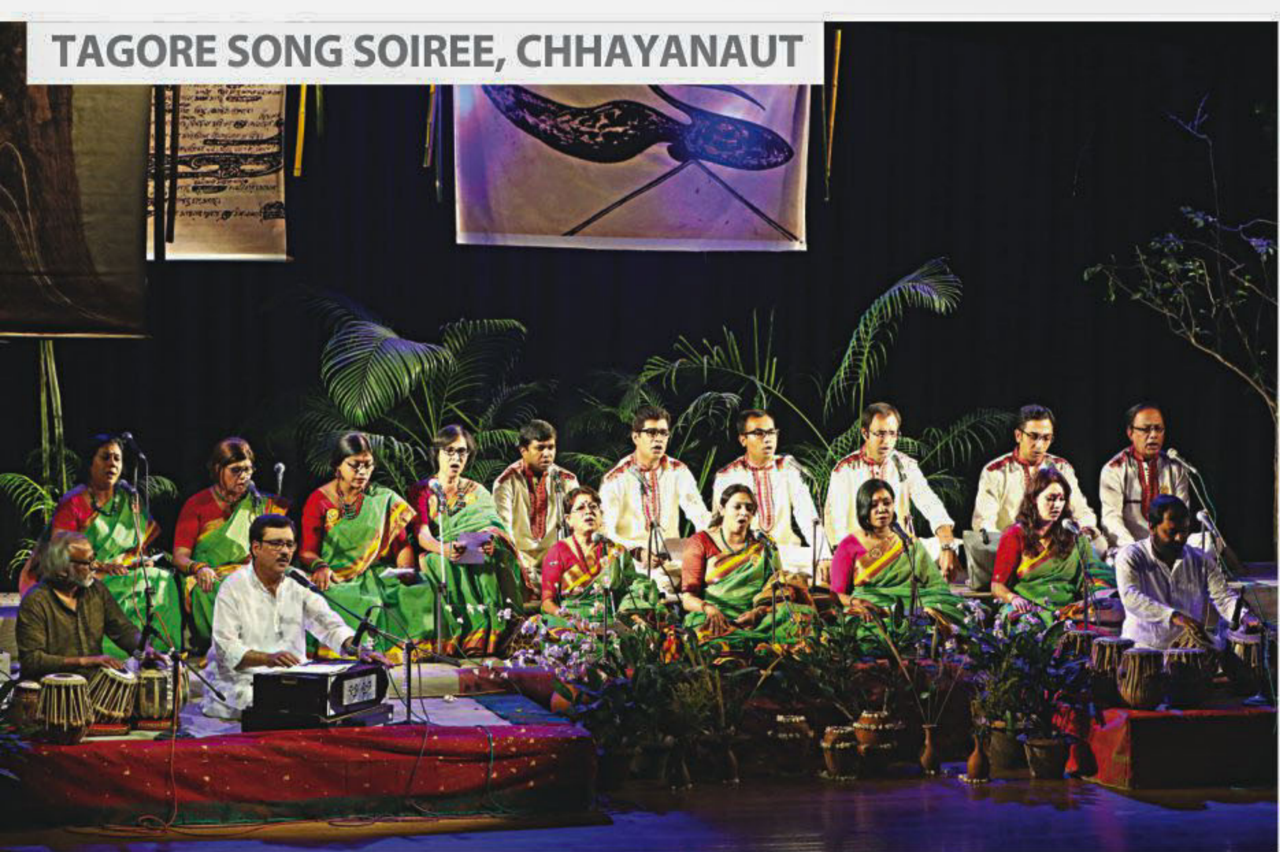
TAGORE SONG SOIREE, CHHAYANAUT

Bangladesh's culture and heritage continued to be celebrated in the year, be it by the Bangladesh Shilpakala Academy's "Bangladesh Cultural Festival", or celebrations of Bashanta (Spring), Noboborsho (Bangla New Year) or Sharat (Autumn).