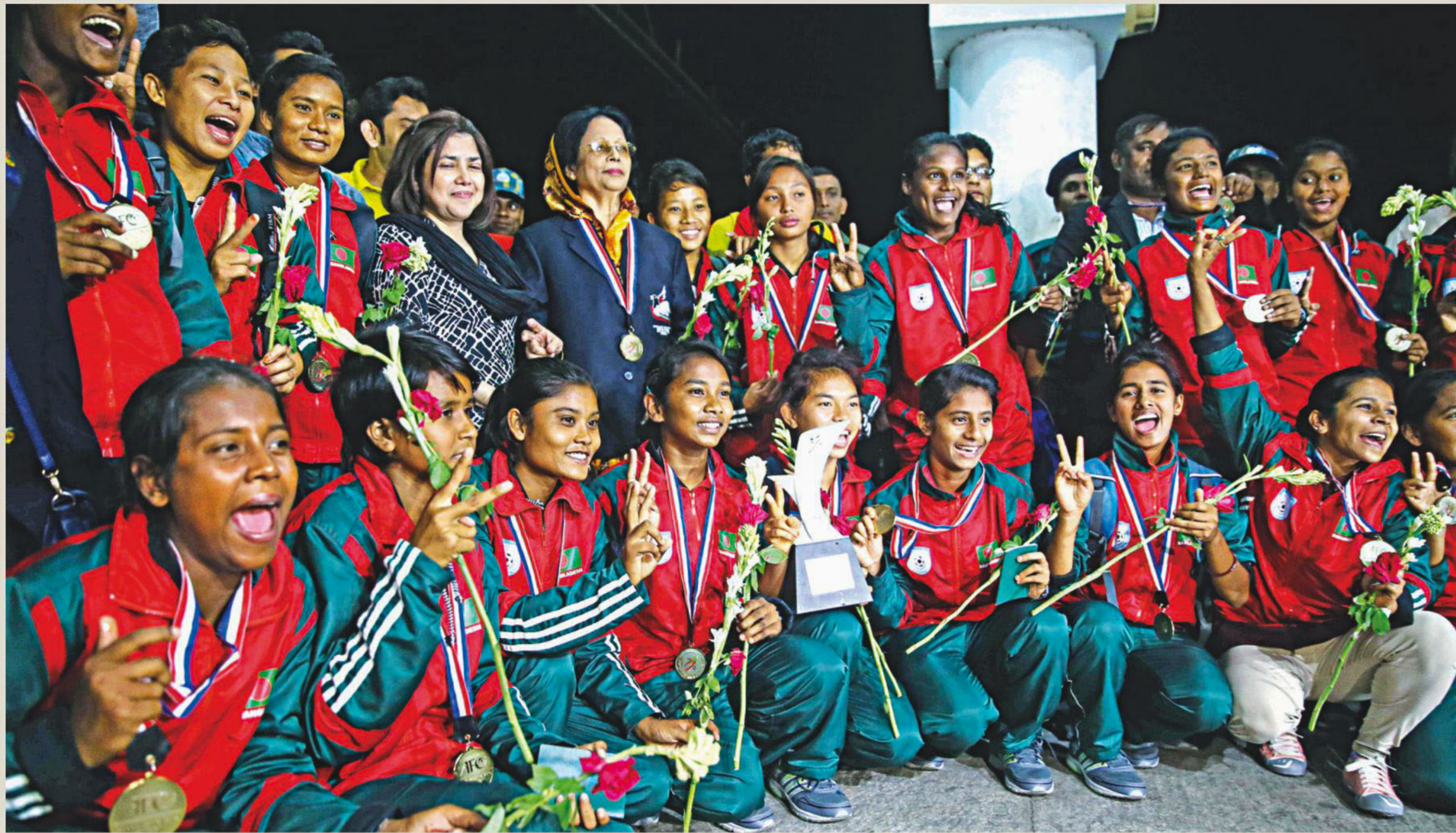
The Bangladeshi under 16 girls' football team wasn't the only group that did well in football in 2016. Their juniors, the under 14 national team, brought accolades by winning the AFC Under-14 Girls Regional (South and Central) Championship. The wins just go on to depict the bright future of women's football in the country.