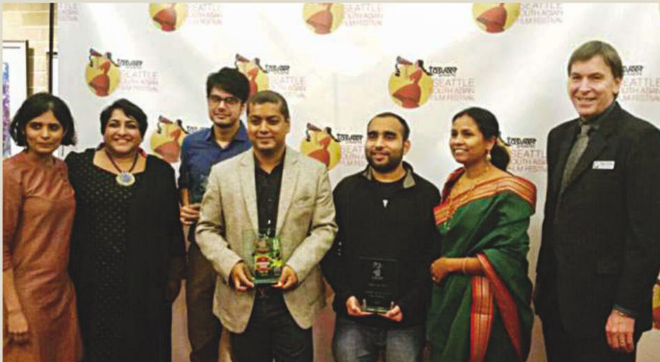
Amitabh Reza Chowdhury's "Aynabaji" won the award of best film at the USA's 11th Seattle South Asian Film Festival.

A ground-breaking project based in Bangladesh, which allows villagers to earn by selling excess solar energy to neighbours, was one of the 13 winners of the United Nations climate change awards. Founded in 2014 as a German-Bangladeshi spin-off of MicroEnergy International GmbH, ME SOLshare has successfully piloted the world's first swarm grid, an ICT-enabled peer-to-peer electricity trading network for rural households with and without solar home systems in Shariatpur of Bangladesh.