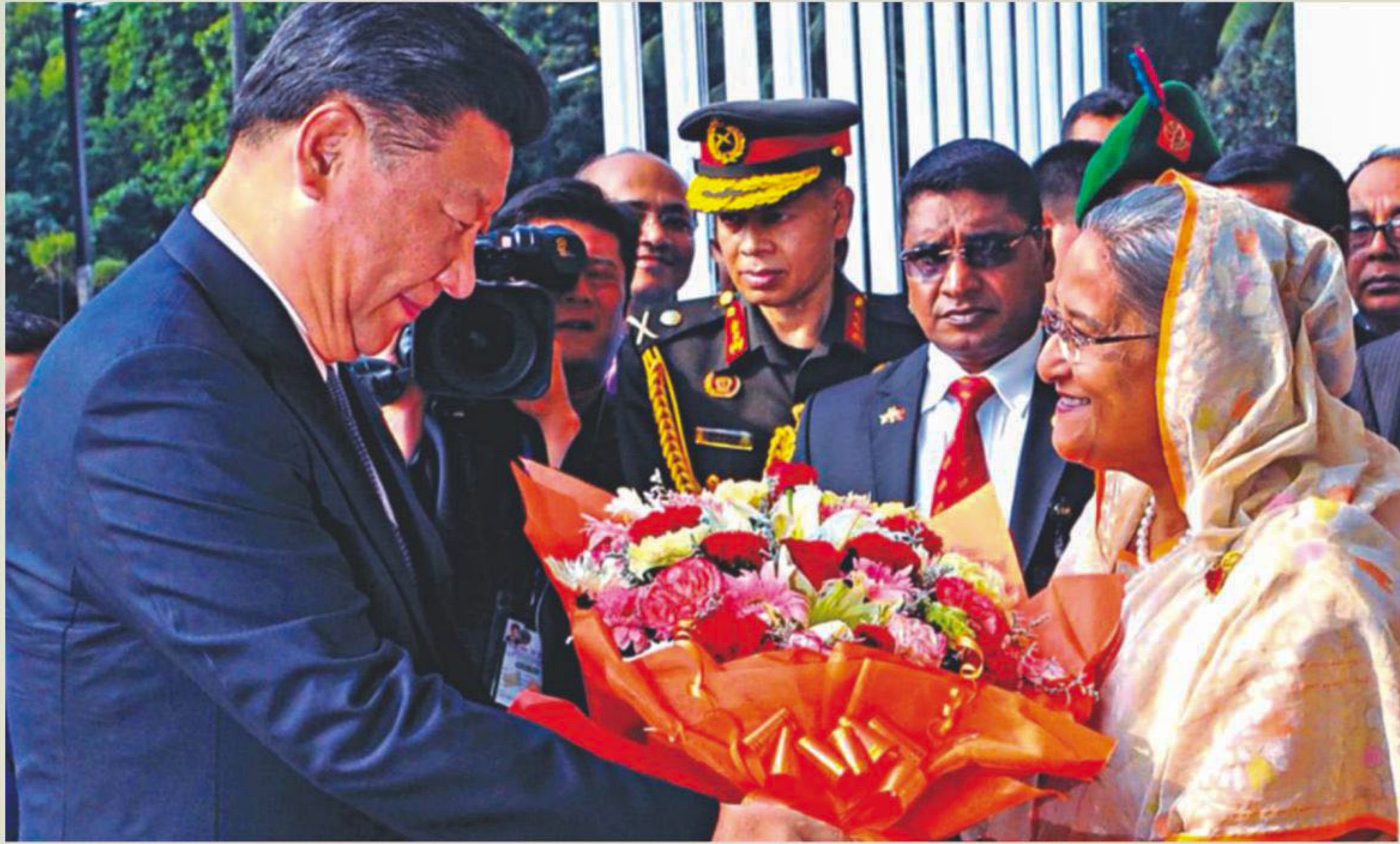
Dhaka and Beijing upgraded ties and agreed on the Silk Road initiative as China inked with Bangladesh 27 deals worth $24.45 billion in soft loan for various key development projects. "China-Bangladesh relationship is now at a new historical starting point and heading towards a promising future," said Xi in a statement at the signing ceremony at the PMO.