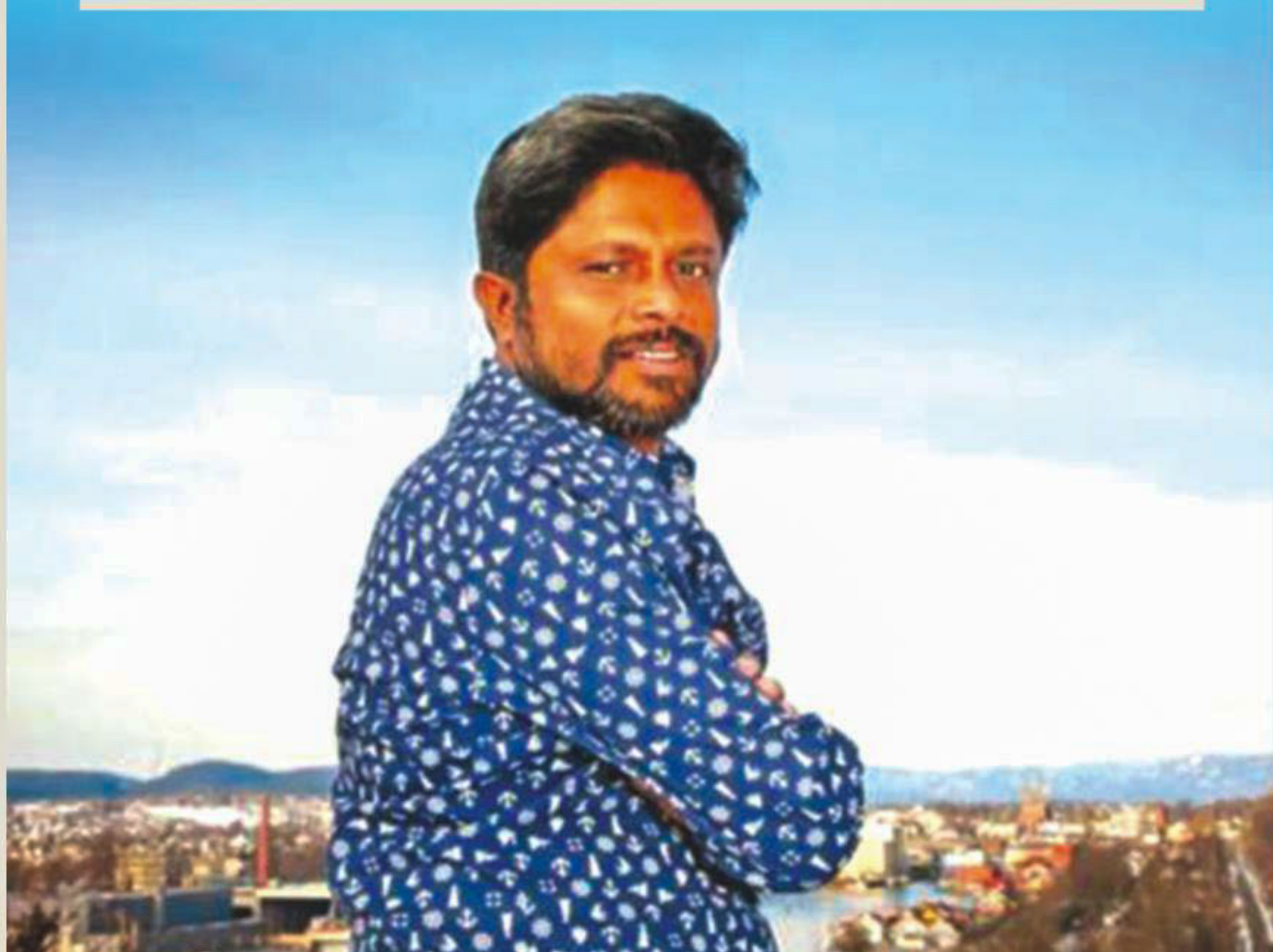
Bangladeshi publisher and writer Ahmedur Rashid Chowdhury Tutul, who survived a militant attack in 2015, was named winner of PEN International Writer of Courage award in 2016 for his bravery in upholding free speech.

A ground-breaking project based in Bangladesh, which allows villagers to earn by selling excess solar energy to neighbours, was one of the 13 winners of the United Nations climate change awards. Founded in 2014 as a German-Bangladeshi spin-off of MicroEnergy International GmbH, ME SOLshare has successfully piloted the world's first swarm grid, an ICT-enabled peer-to-peer electricity trading network for rural households with and without solar home systems in Shariatpur of Bangladesh.