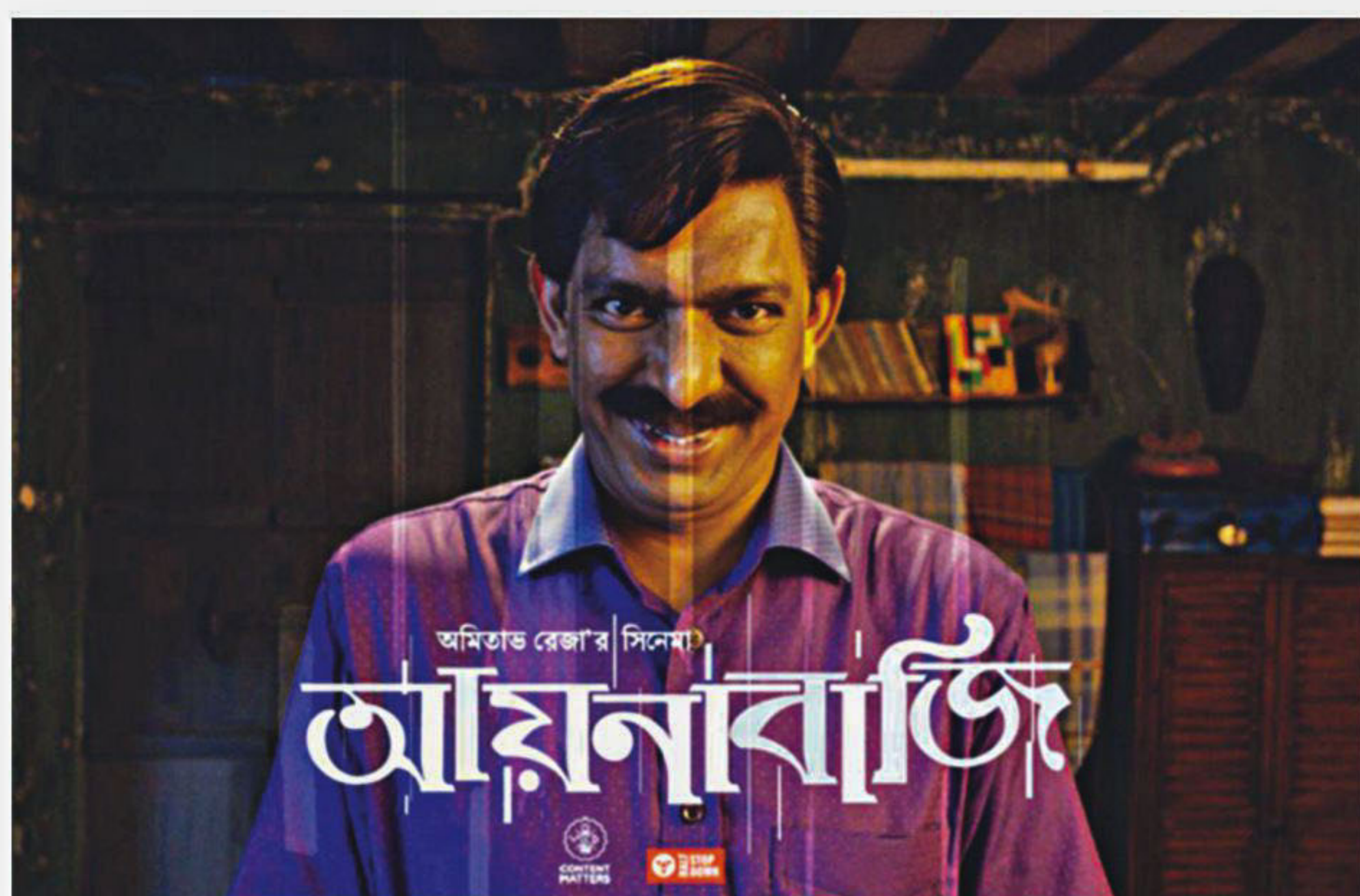
People of all walks of life rushed to movie theatres to watch the film.