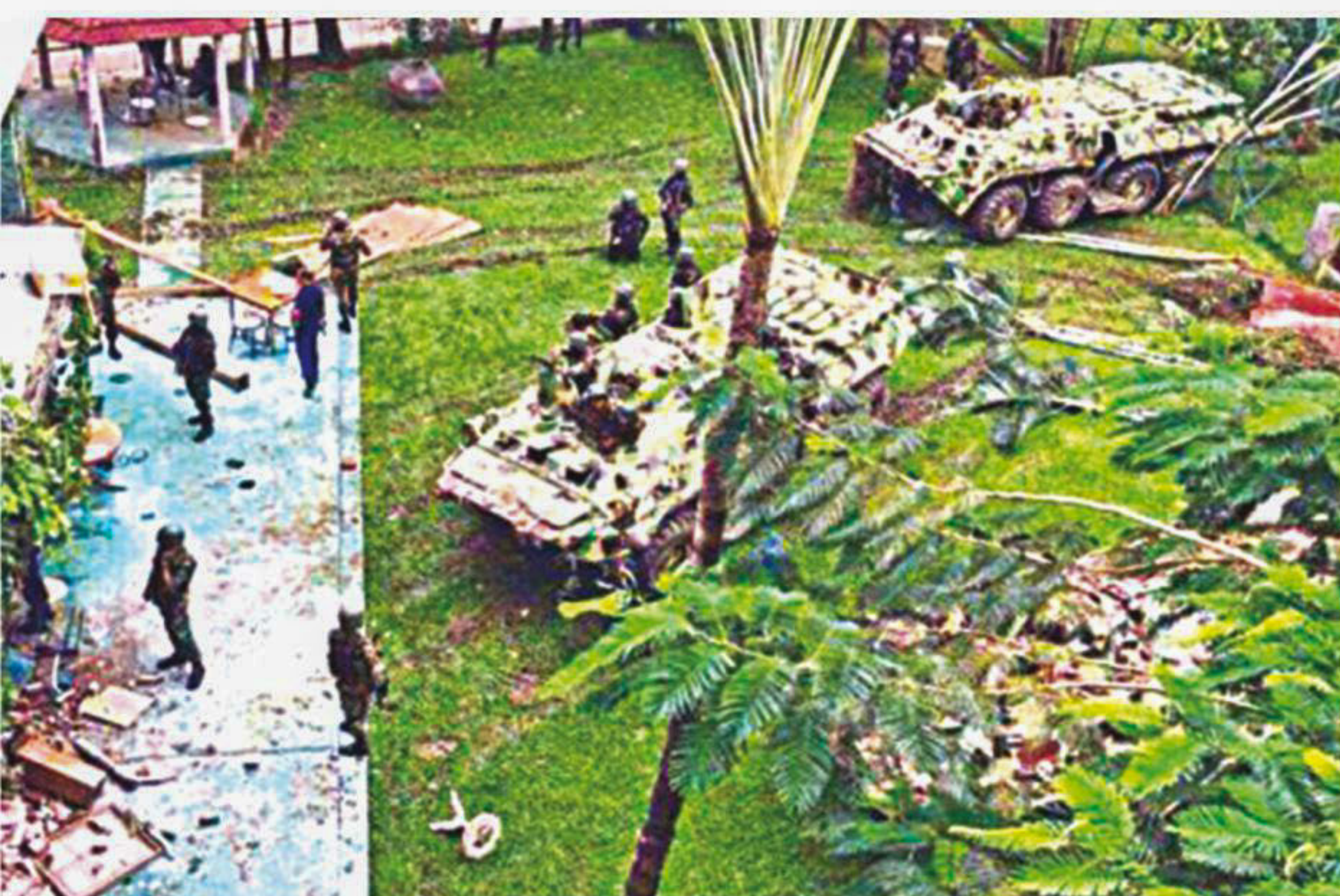
Army personnel secure the Holey Artisan Bakery in Gulshan after they stormed the restaurant in armoured personnel carriers breaking through its fences on July 2, 2016.

The crime thriller directed by Amitabh Reza, starring Chanchal Chowdhury, Masuma Rahman Nabila and Partha Barua in lead roles altered the way commercial movies made in this country have been perceived by the mainstream audience. With a solid storyline, melodious songs, powerful acting and superb directing, the movie attracted