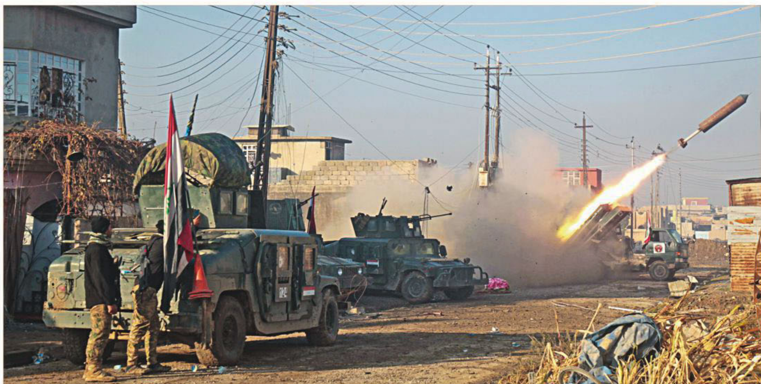
Iraqi forces launch a rocket in Mosul's eastern Al-Intisar neighbourhood on Friday, during an ongoing military operation against Islamic State (IS) group jihadists. Iraqi forces advanced on December 29 after declaring a new phase in their offensive on eastern Mosul, stepping up efforts to reclaim the Islamic State group's last major stronghold in the country.

Ban added that as UN chief, he also has been guided by a desire "to keep the focus on people -- on people's rights and people's dignity... and to stand up for those who are left behind."