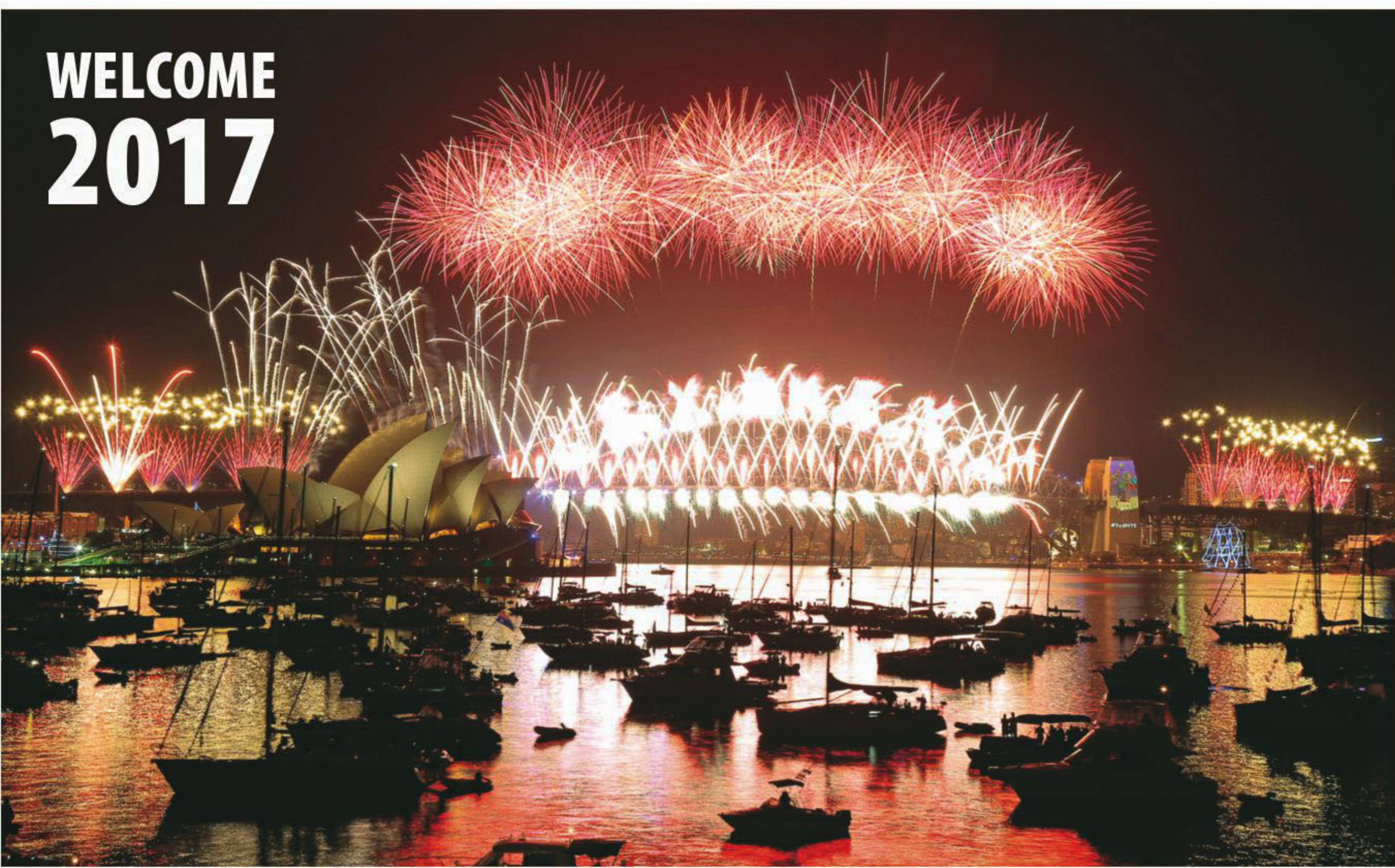
Fireworks explode over the Sydney Opera House and Harbour Bridge as Australia ushers in the New Year in Sydney. Australia rang in the new year with a spectacular fireworks display in Sydney, sending rainbow-coloured showers into the night sky and defying the global terror attacks that cast a pall over 2016.