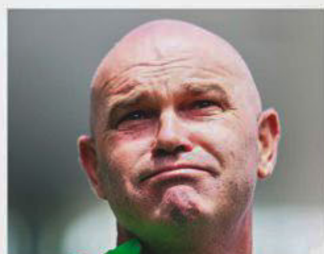
MARTIN CROWE 1962-2016