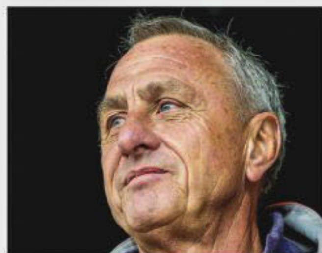
JOHANN CRUYFF 1947-2016