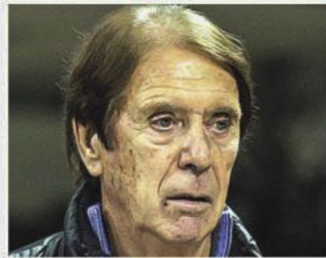
CESARE MALDINI 1932-2016