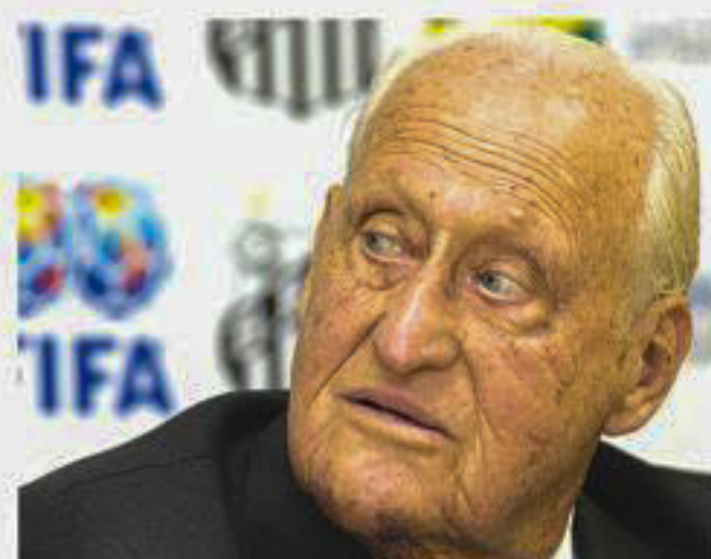
JOAO HAVELANGE 1916-2016