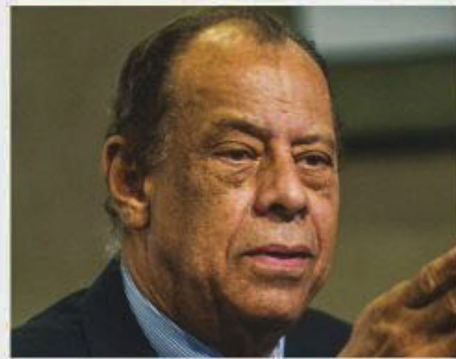
CARLOS ALBERTO 1944-2016