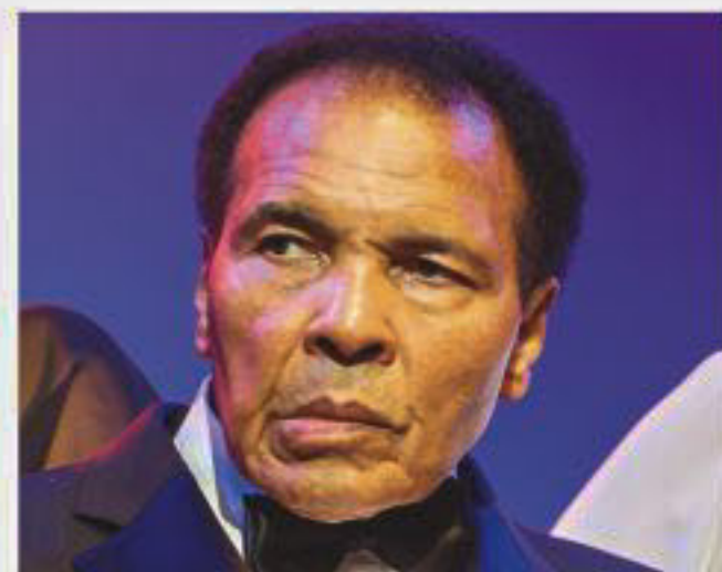
MUHAMMAD ALI 1942-2016