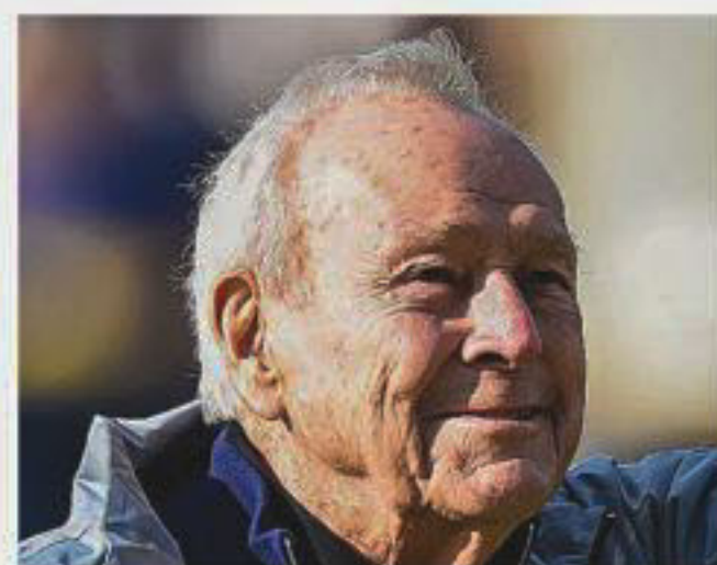
ARNOLD PALMER 1929-2016