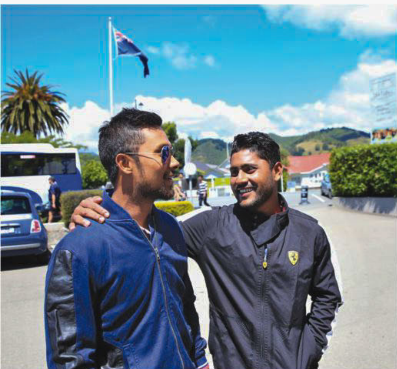
(L) Sabbir Rahman and Imrul Kayes might have been involved in a fate-changing run-out in the second ODI on Thursday, but there clearly weren't any hard feelings between them off the field as they both smile while posing for a photo outside the team hotel in Nelson. (R) Mashrafe Bin Mortaza, Shakib Al Hasan and Mushfiqur Rahim are on their way back to the hotel following Friday prayers.