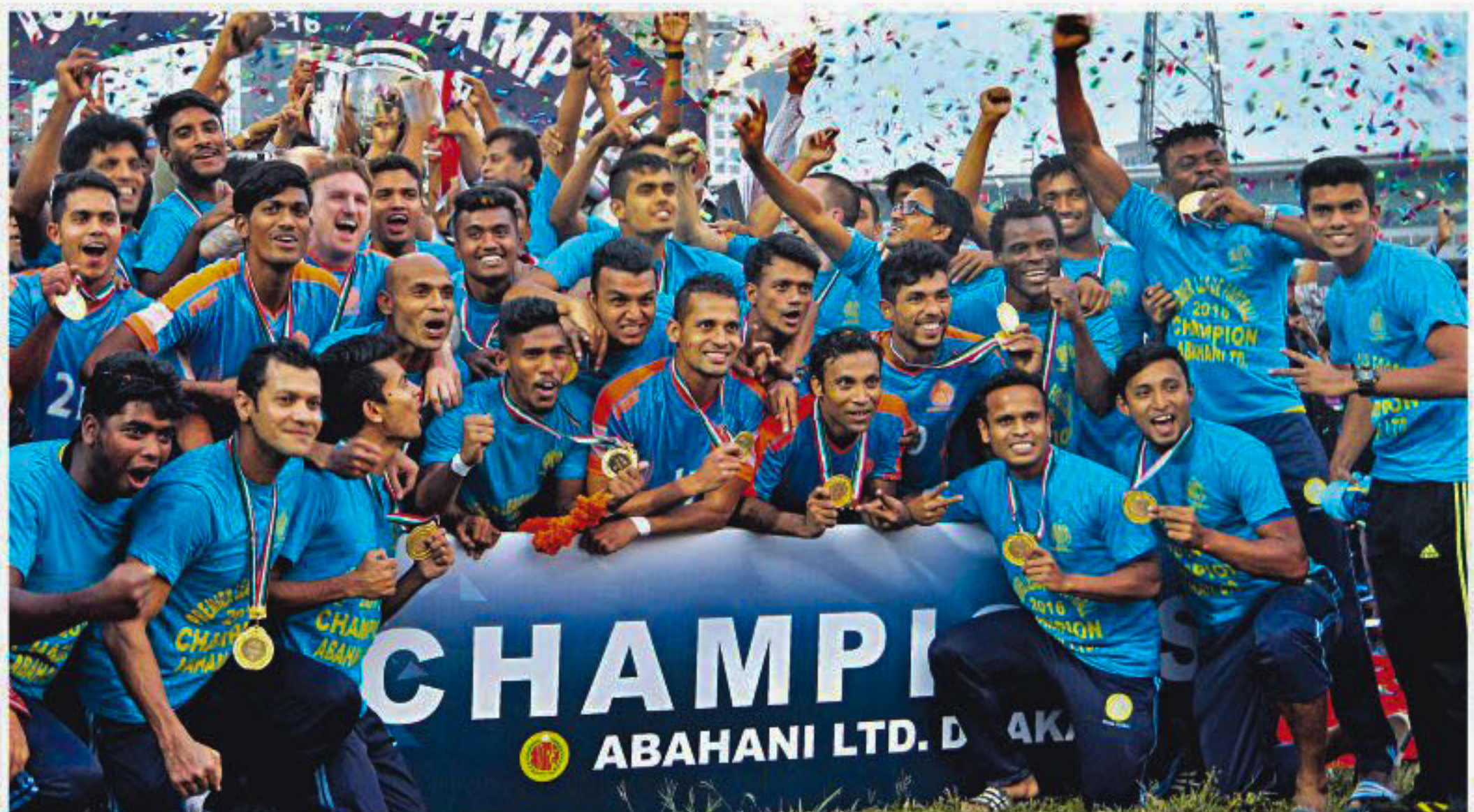
Players and officials of champions Abahani celebrate with the Bangladesh Premier League trophy at the end of their final league match at the Bangabandhu National Stadium yesterday.

The league will be wrapped up today with two matches – Feni Soccer taking on Muktijoddha Sangsad and Arambagh KS playing against Team BJMC.