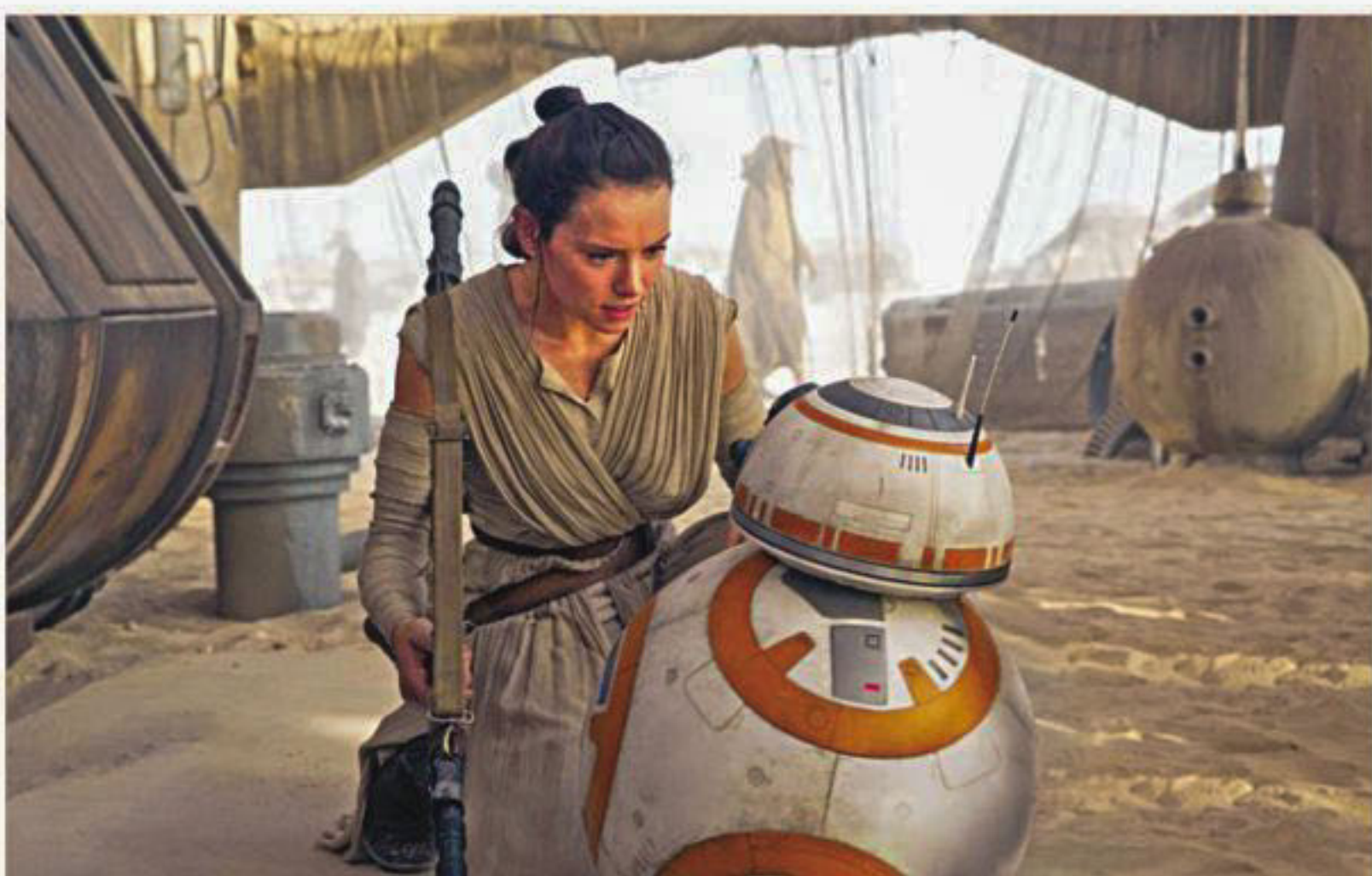
Daisy Ridley and her “Star Wars: Episode VIII” are both on fans' top list.

Emma Watson was voted the most anticipated actress for