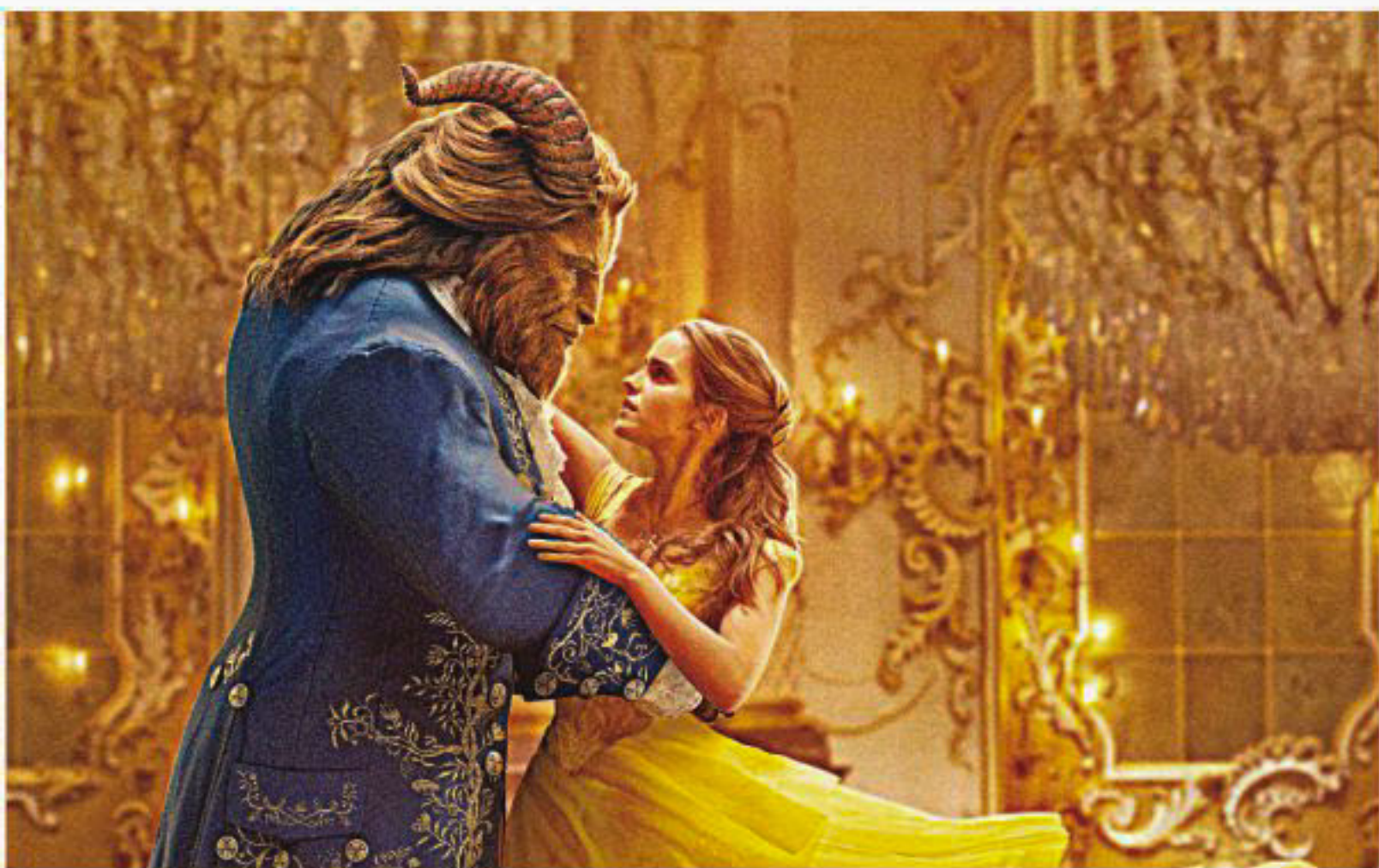
Emma Watson in the upcoming “Beauty and the Beast”.