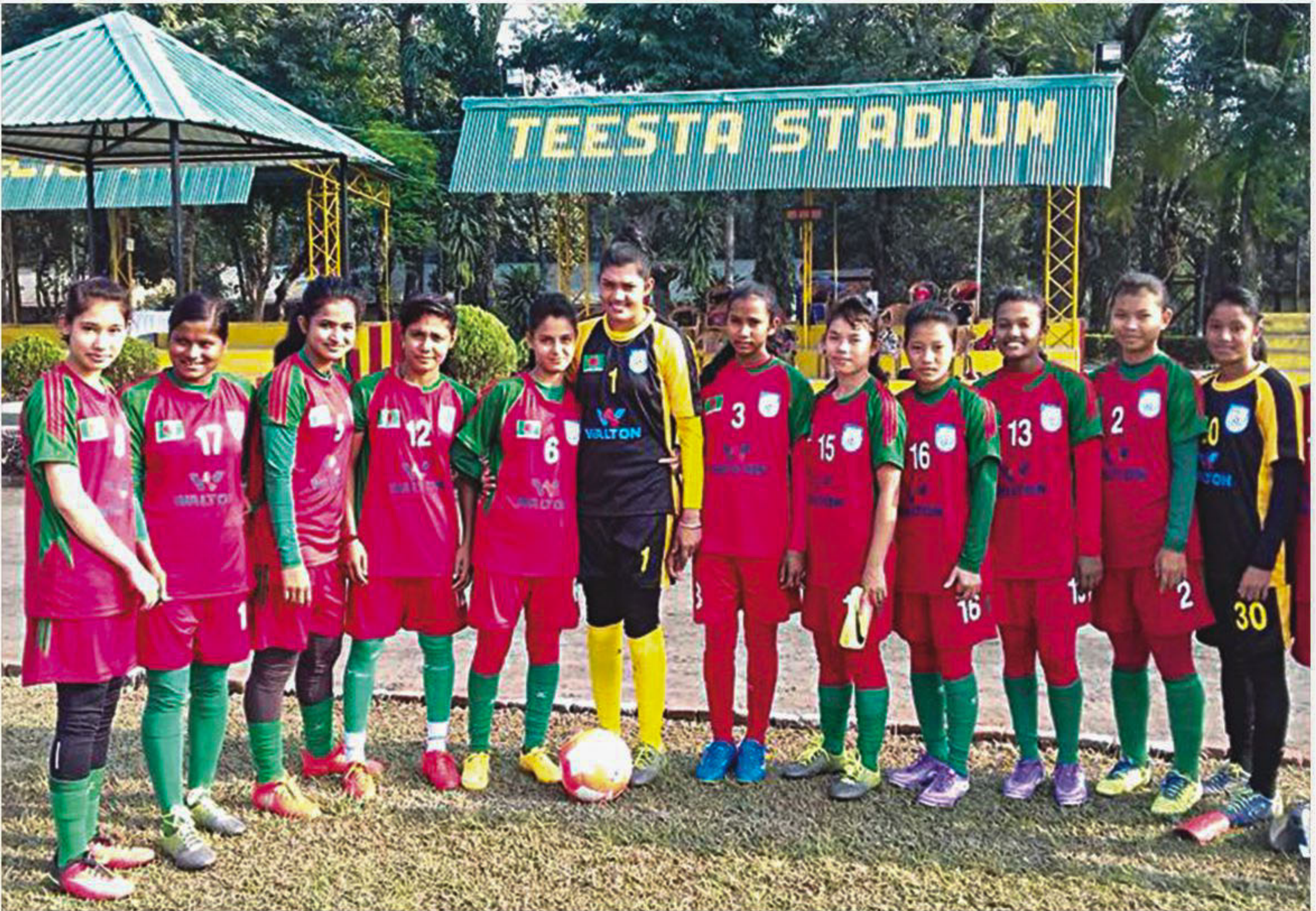
Bangladesh players pose for photographs at Siliguri's Teesta Stadium yesterday on the eve of their SAFF Women's Championship fixture against Afghanistan.

"India won the match but Afghanistan are a good side, who have two quality forwards and we will have special plan for those two players. However, I believe we can beat them to confirm the semifinal berth," said the 23-year-old captain, who has been representing Bangladesh since 2009.