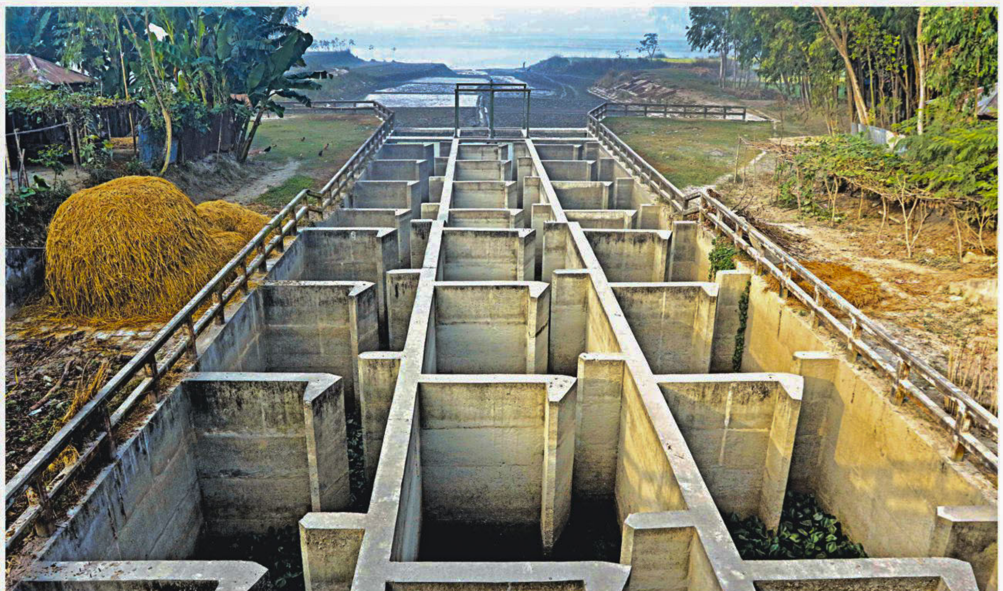
The fish pass in Devdaha village in Bogra's Shariakanda upazila remains useless in the winter due to lack of water. Bangladesh Water Development Board had built the structure in 1996 to enable passage of fish to and from the Jamuna and the Bangalee rivers. But the fish pass has no use now as the Jamuna has almost dried out there. The photo was taken last week.