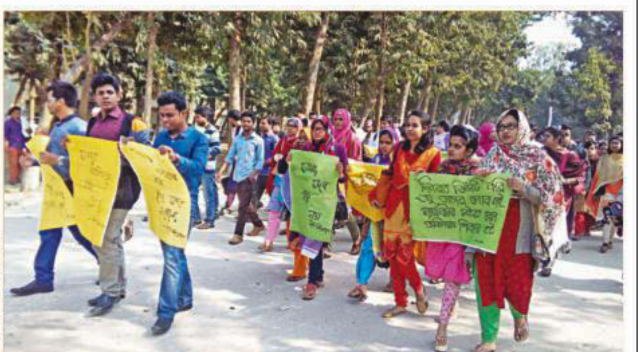
Rajshahi Medical College Hospital interns bring out a procession yesterday demanding workplace security.