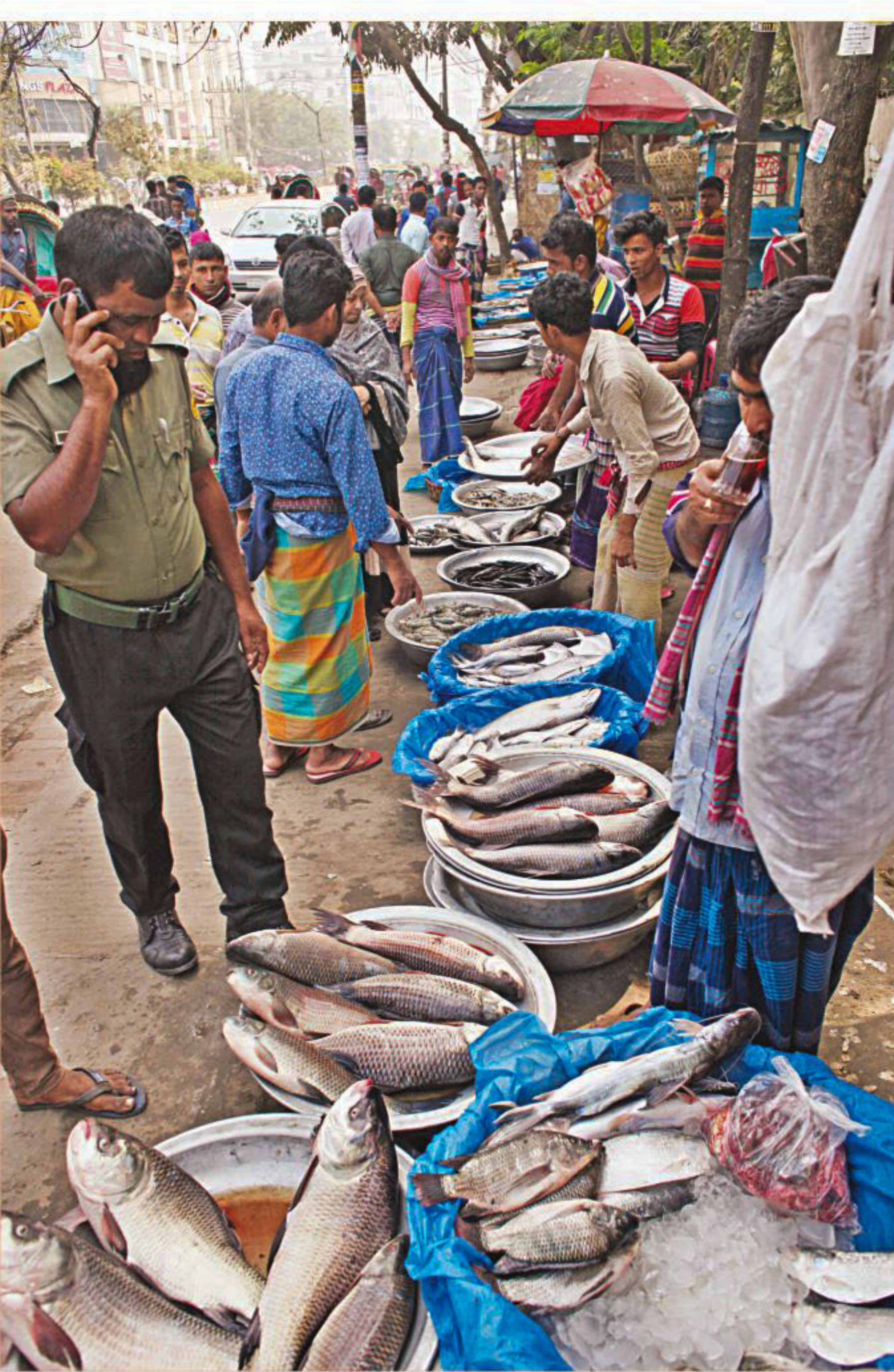
Fishmongers occupy a footpath on Satmasjid Road in the capital yesterday to carry out their trade, forcing pedestrian onto the street and path of oncoming vehicles.

Agitated locals set fire to the house of Daulat and ransacked seven to eight vehicles. Police charged baton to bring the situation under control.