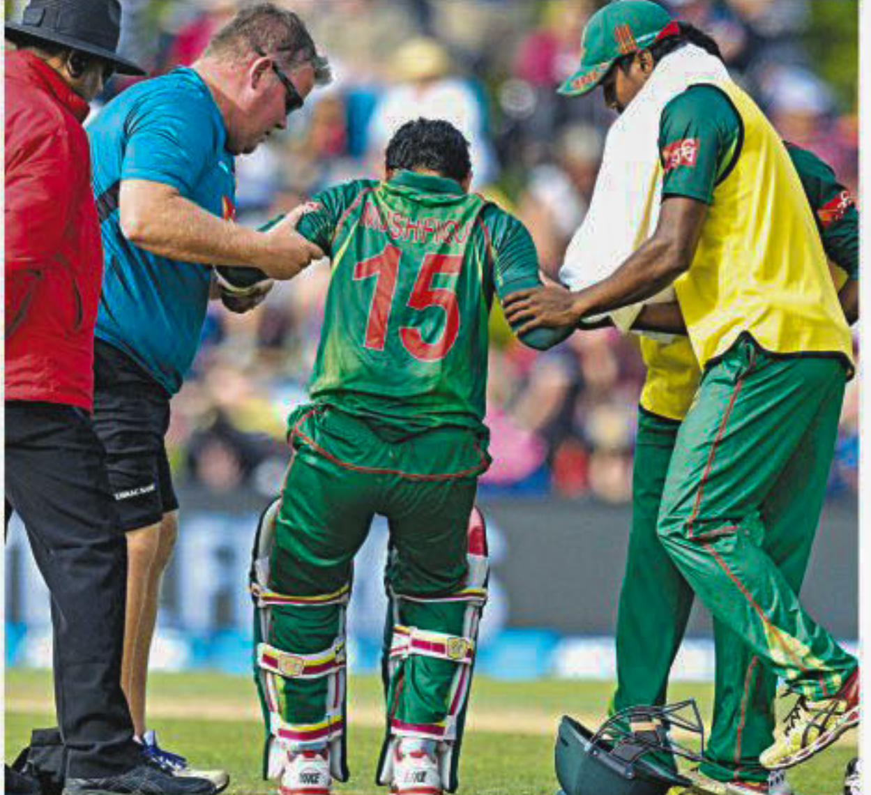
Bangladesh wicketkeeper Mushfiquur Rahim limps off the ground after suffering a hamstring injury in Christchurch yesterday.