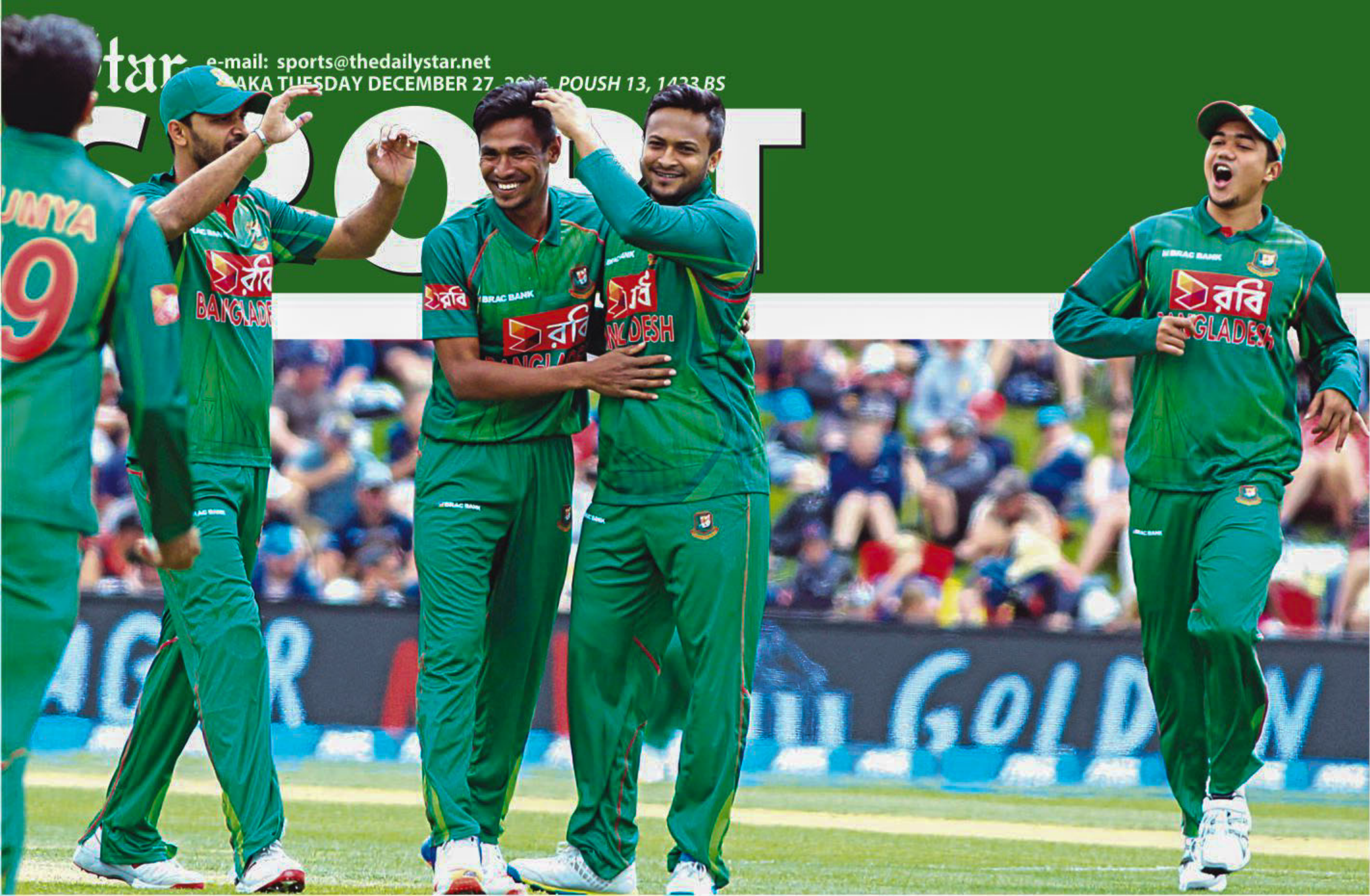
Shakib Al Hasan (second from R) and Mashrafe Bin Mortaza (second from L) congratulate Mustafizur Rahman after the left-armer dismissed Martin Guptill early in the first ODI on Monday in Christchurch. Unfortunately for the Tigers, this was one of their rare good moments, as they struggled on the field.