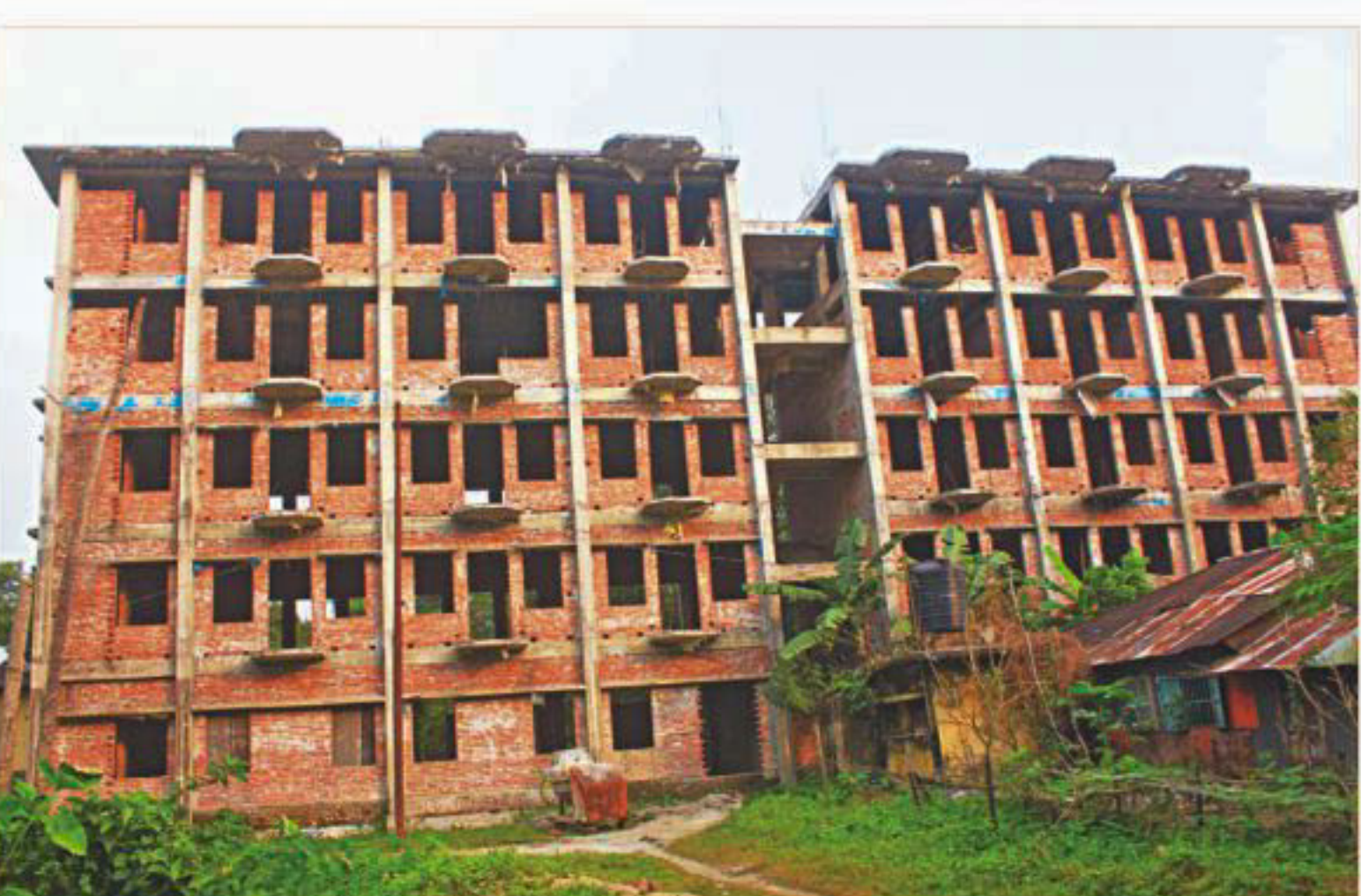
PICTURES TELL THE TALE. A student studies in a room at the Kobi Jibanananda Das Hostel of Government BM College, Barisal. Around 120 students are crammed inside the tin-roofed dilapidated structure, bottom left , while the much awaited five-storied hostel building, bottom right , is yet to be completed even after six years. The photos were taken recently.