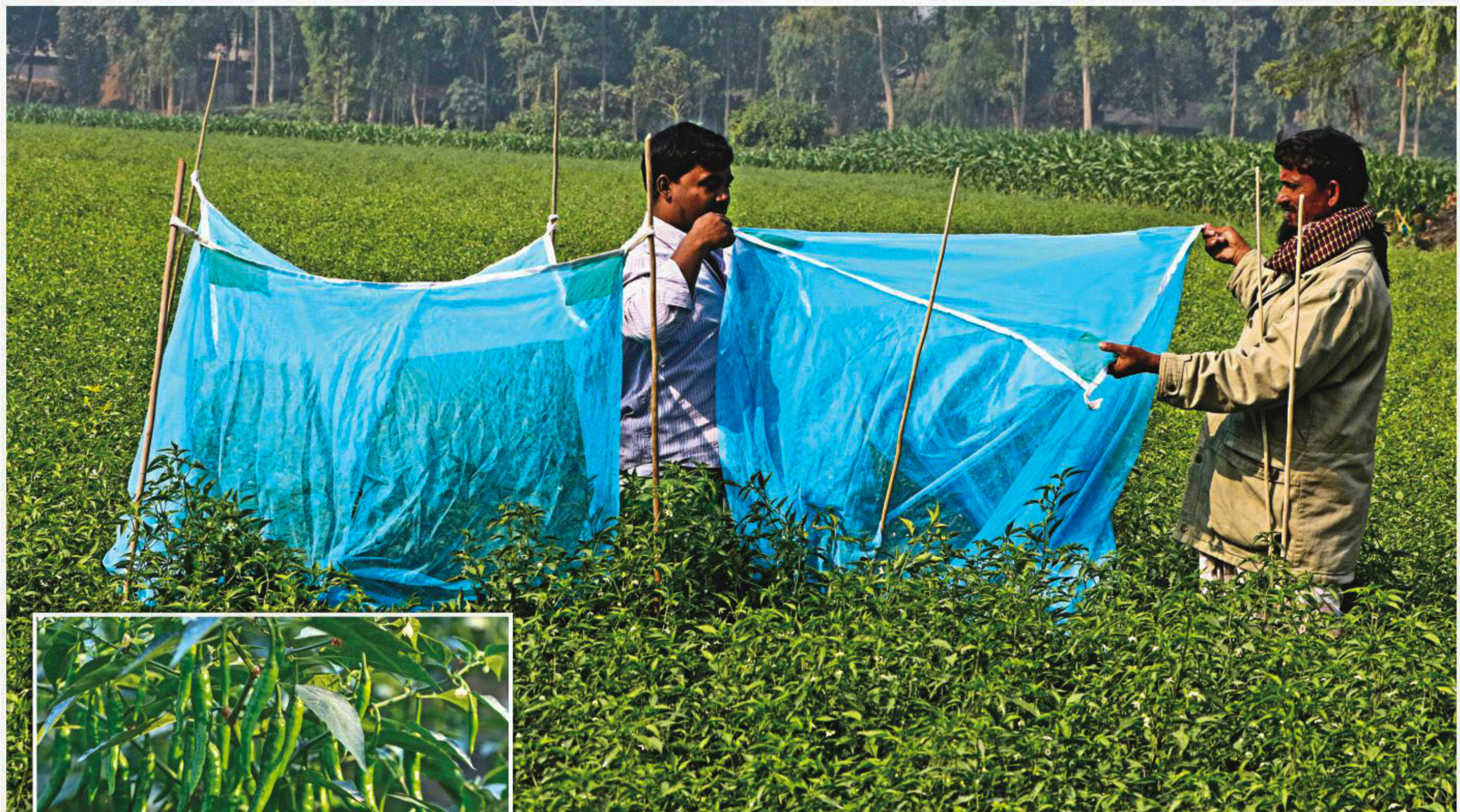
Chilli growers in Gaibandha's Phulchhari upazila have innovated a way to protect plants from insects. They are using mosquito nets instead of pesticides. In the upazila, many farmers have become solvent by cultivating chilli. The photo was taken at Fajlupur union a few days ago.