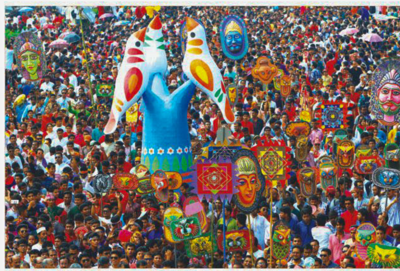
Mongol Shobhajatra has become one of the most signature cultural celebrations of Bangladesh.