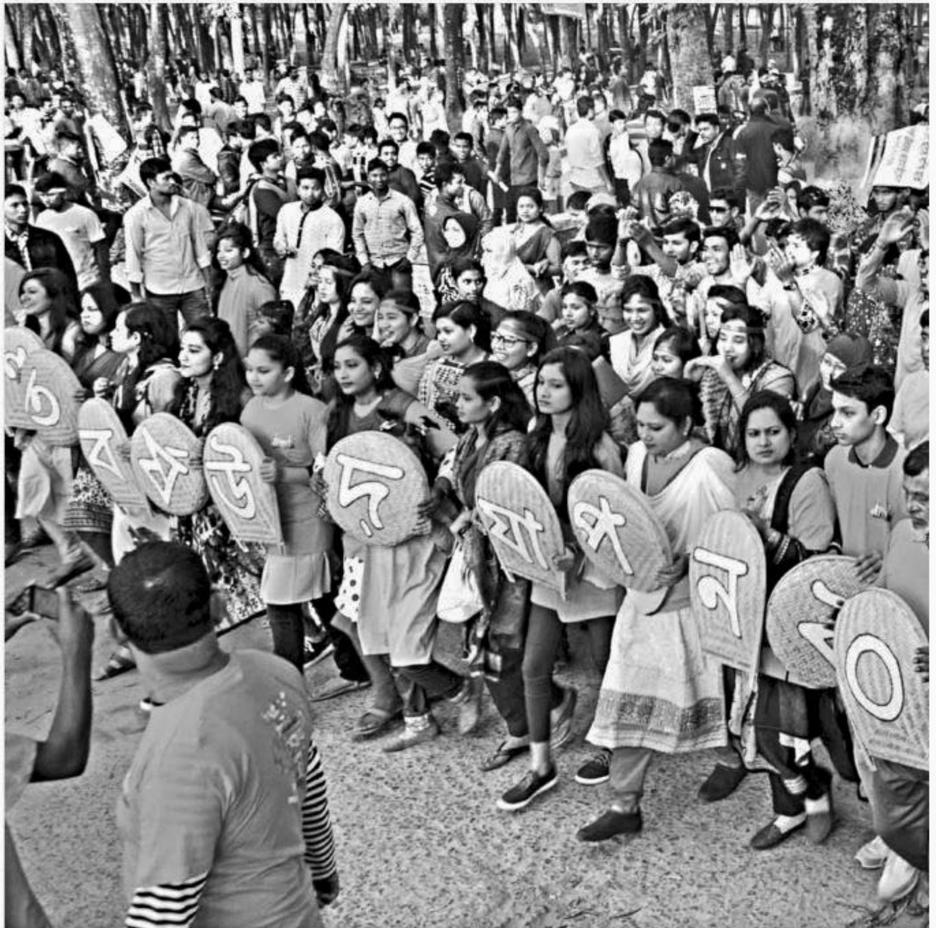
Marking 100 years of Carmichael College Rangpur, its students and teachers bring out a celebration procession from the campus yesterday and paraded different streets of the city. Around 25,000 students are studying at higher secondary, degree (pass) course, honours and master's levels at the college situated on about 900 bighas of land.