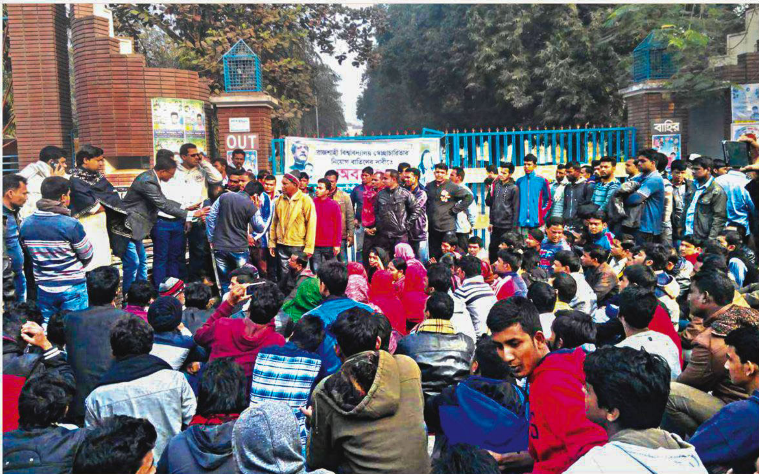
Leaders and activists of AL and BCL stage a sit-in at the main gate of Rajshahi University yesterday morning after driving out examinees of a staff recruitment test at RU.