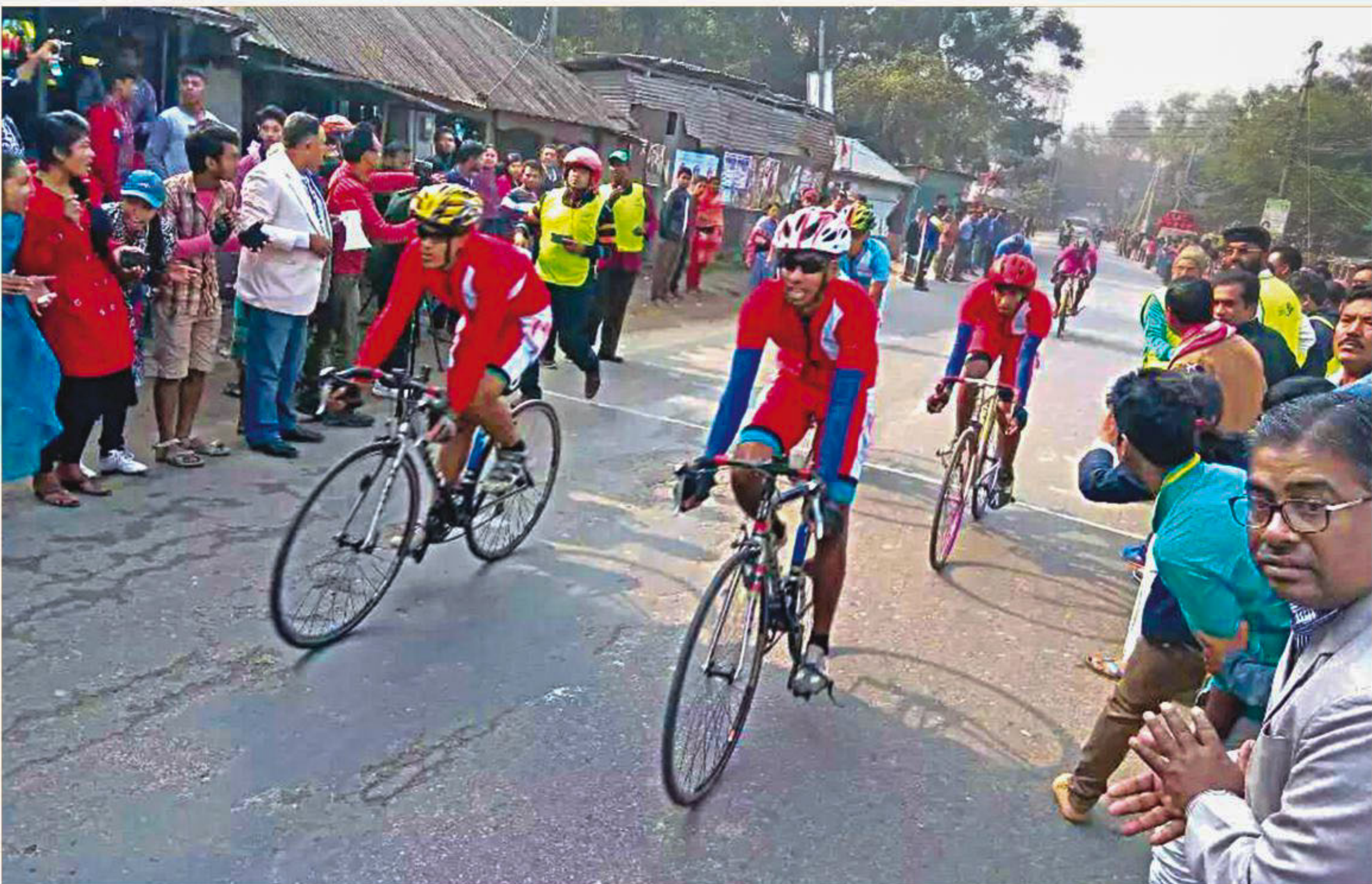
Cyclists ride through the Gopalganj-Tungipara leg of the Fortune Tour de Bangladesh as spectators cheer them on during the second day of the cycling competition yesterday.

The third day of the race will see all the remaining cyclists take a ride of seven laps around the Hatirjheel Lake in Dhaka, after which the winners will be adjudged based on their cumulative scores.