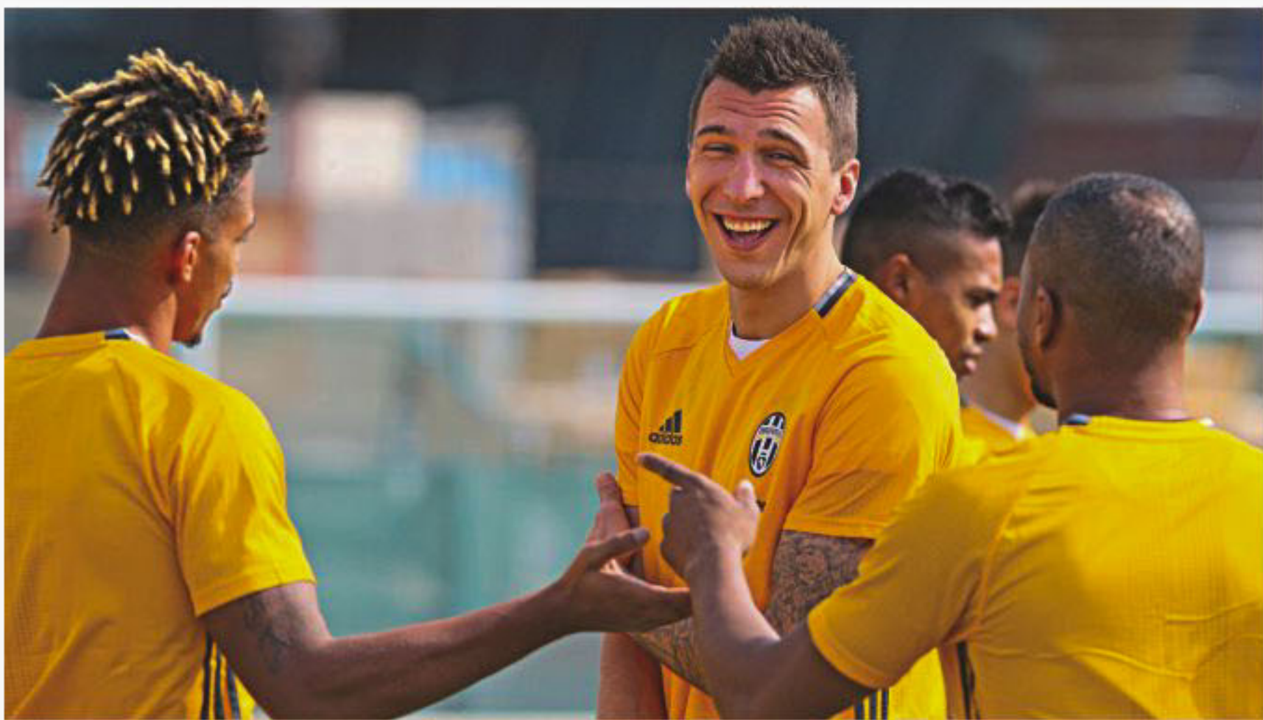
Juventus striker Mario Mandzukic (C) chats with his teammates as they arrive for a training session in Doha yesterday, two days before their Italian Super Cup final against AC Milan.

Some reports in Italy claimed Milan could forego the final if they fail to fly out on Wednesday.