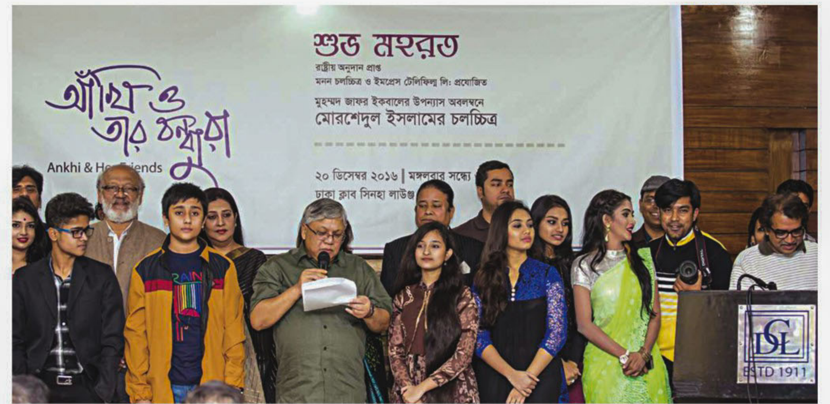
The director along with the cast and crew of the film at the launch.