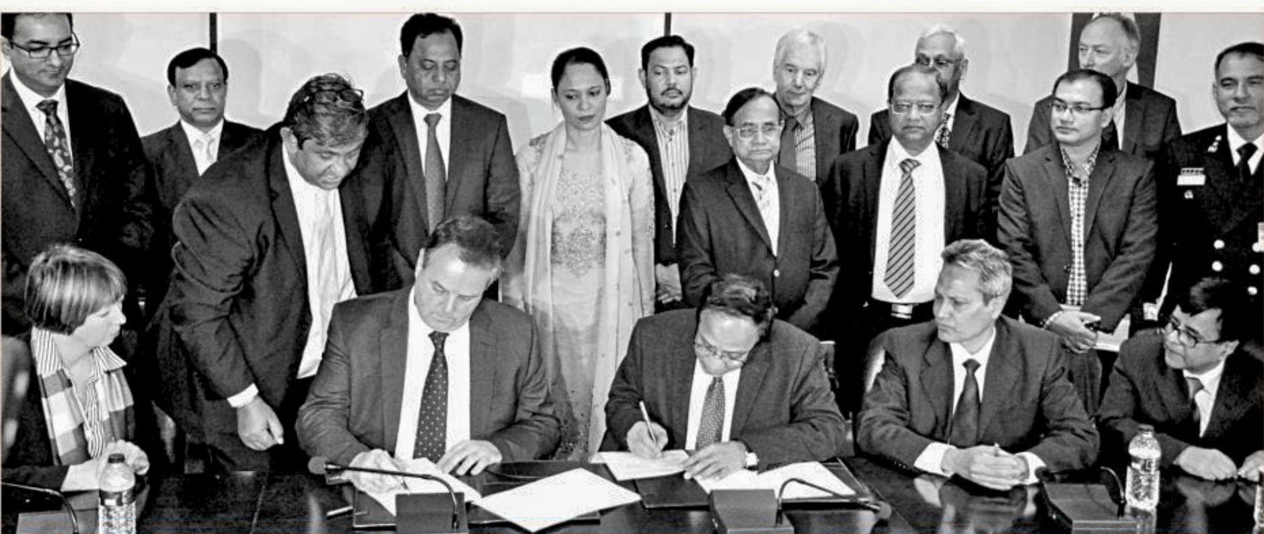
Officials of Bangladesh Railway and British firm DP Rail in the city's Rail Bhaban ink a memorandum of understanding on setting up a railway link between Dhaka and the Payra seaport in Patuakhali. Railway Minister Mazibul Hoque and UK Prime Minister's Trade Envoy for Bangladesh Rushanara Ali MP were present.