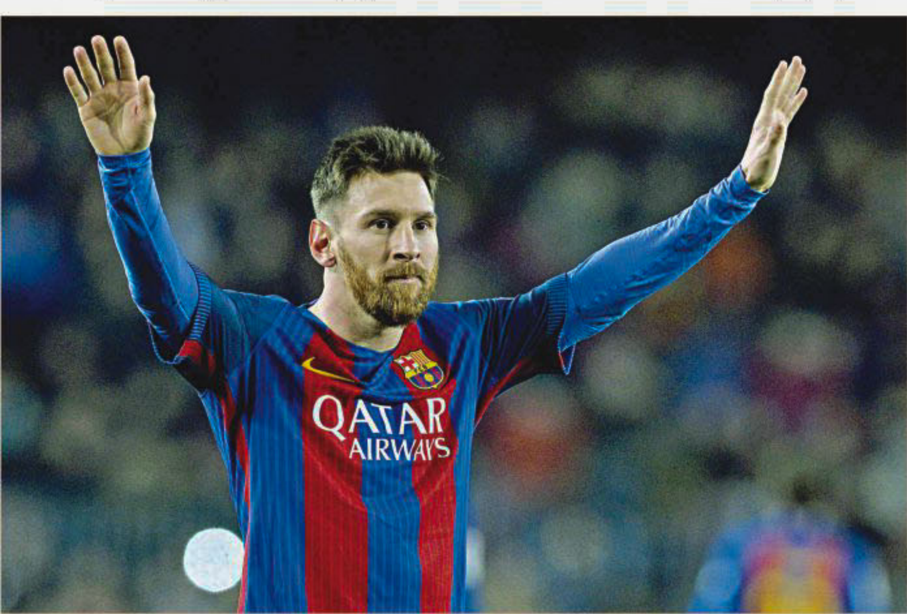
Barcelona superstar Lionel Messi celebrates his goal against Espanyol during their La Liga match at the Nou Camp on Sunday.