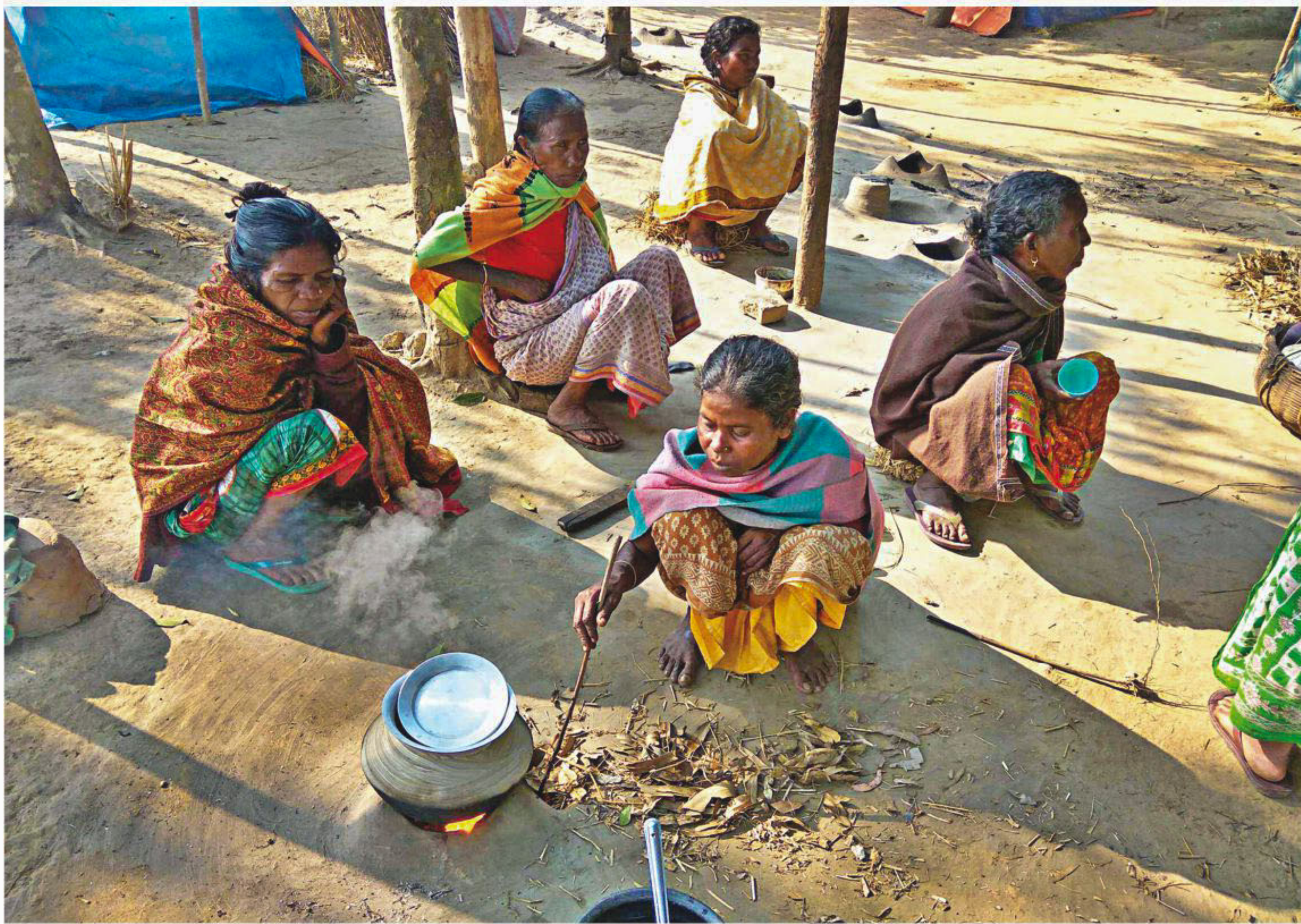
A Santal woman cooks on an earthen stove in the open fuelling the stove with dry leaves near the Rangpur Sugar Mills farmland in Madarpur of Gobindaganj in Gaibandha on Victory Day. Many Santals have been evicted from the land which they claim belong to them.