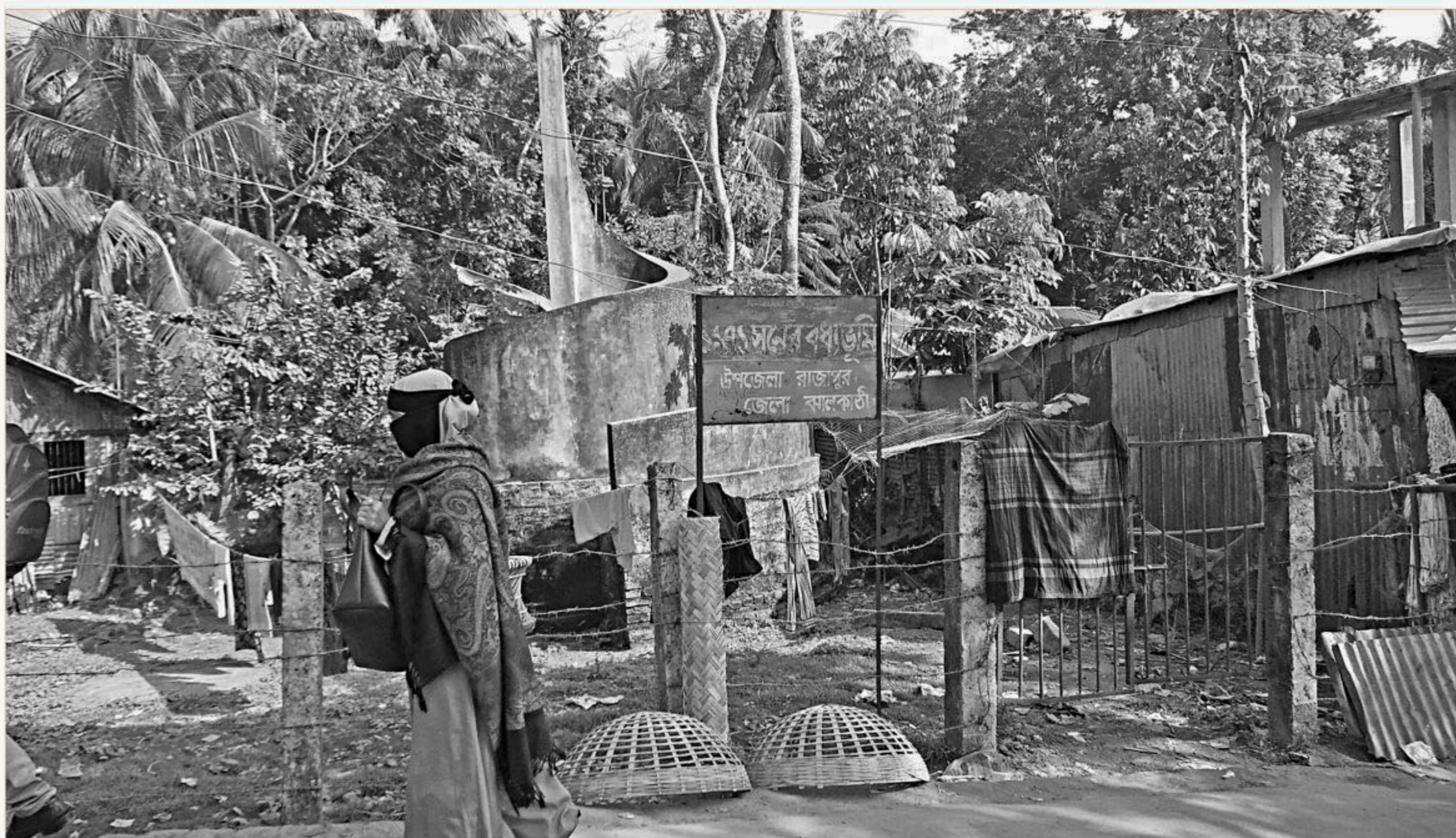
A woman walks past a killing ground lying uncared for years in Bagri Bazar area in Rajapur upazila of Jhalakathi.