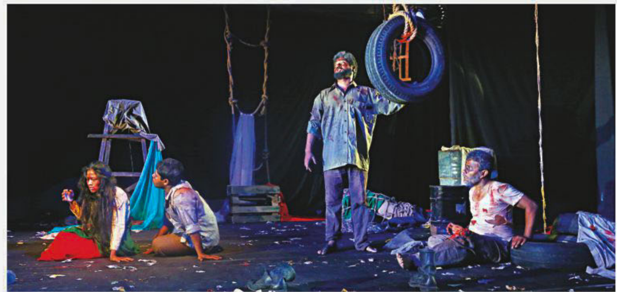
A scene from "Poramati".