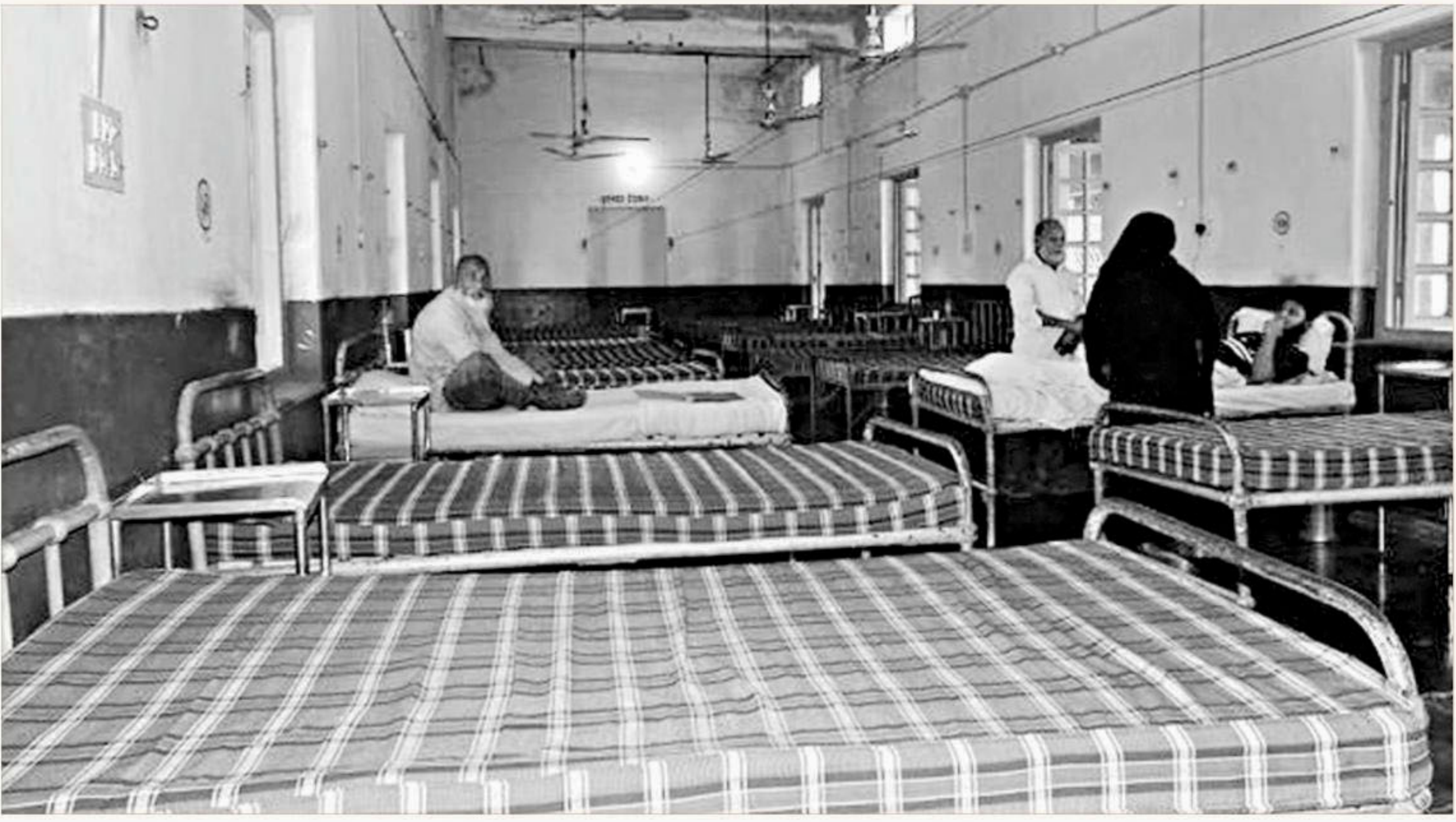
Beds lie empty in the Divisional Railway Hospital at Saidpur as patients are reluctant to go there for treatment due to the lack of doctors and equipment for carrying out pathological tests.