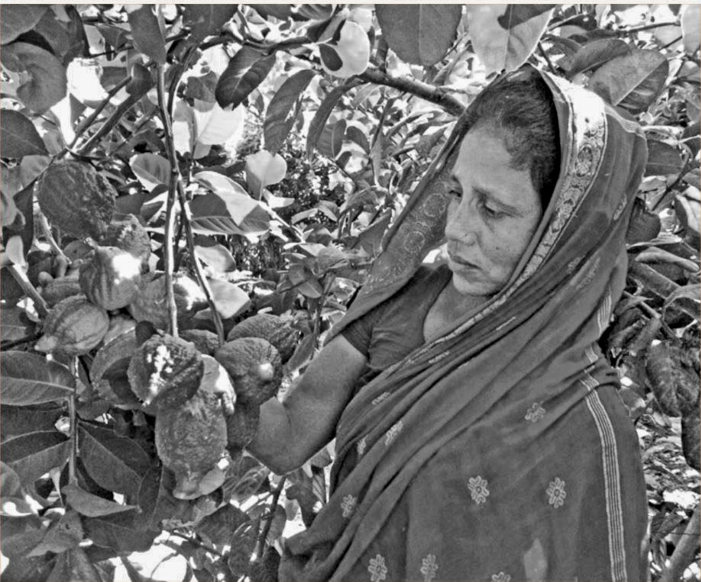
A female worker takes care of lemon at an orchard in Narsingdi. The photo was taken a few days ago.

Shamlal Agarwal, son of a martyred couple, lamented, "It is another tragedy that no memorial has yet to be built at Golahat mass grave while 45th Victory Day is approaching."