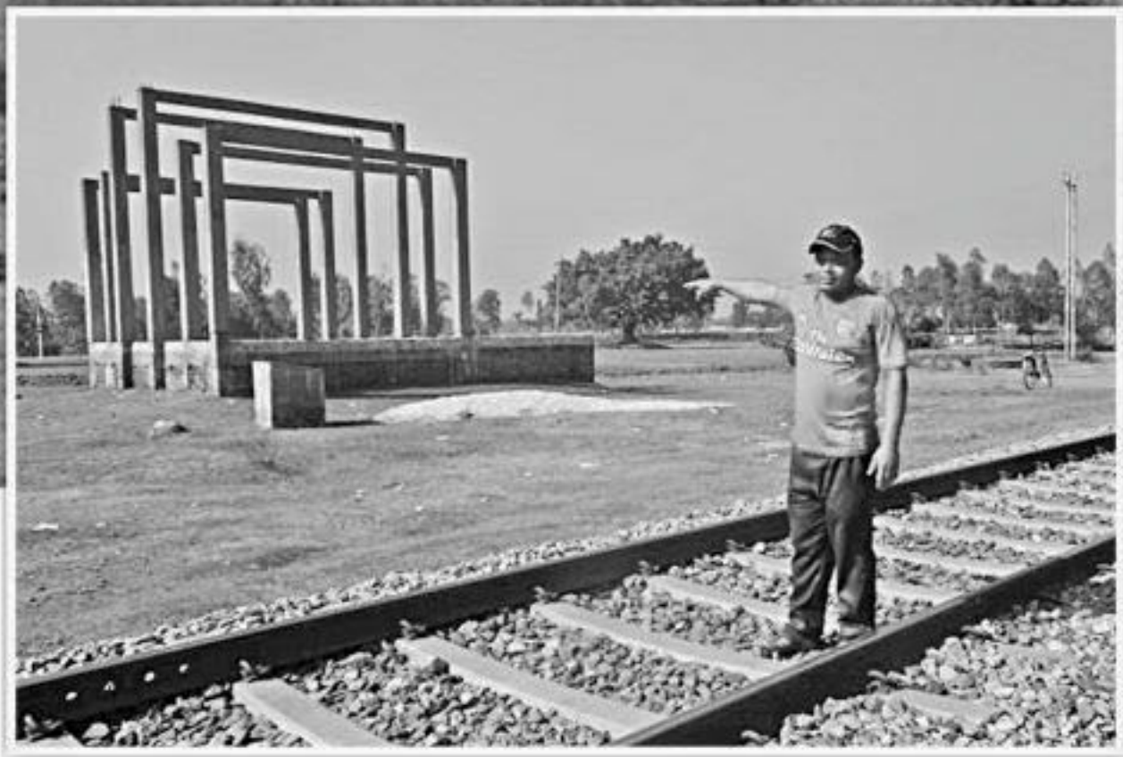
Golahat mass grave, a reminder of the brutal massacre of 437 Marwaris by the Pakistan army and Urdu speaking Biharis near Saidpur railway station in Nilphamari on June 13 in 1971. Inset, construction of a memorial, initiated by locals, remains incomplete due to fund constraints.