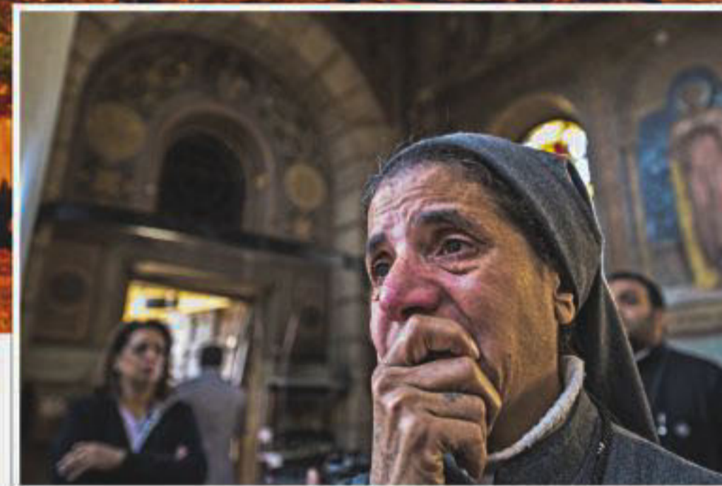
Police at the site of an explosion in central Istanbul, Turkey, and a nun at the scene of a bomb blast at Saint Peter and Saint Paul Coptic Orthodox Church in Cairo, Egypt, yesterday.